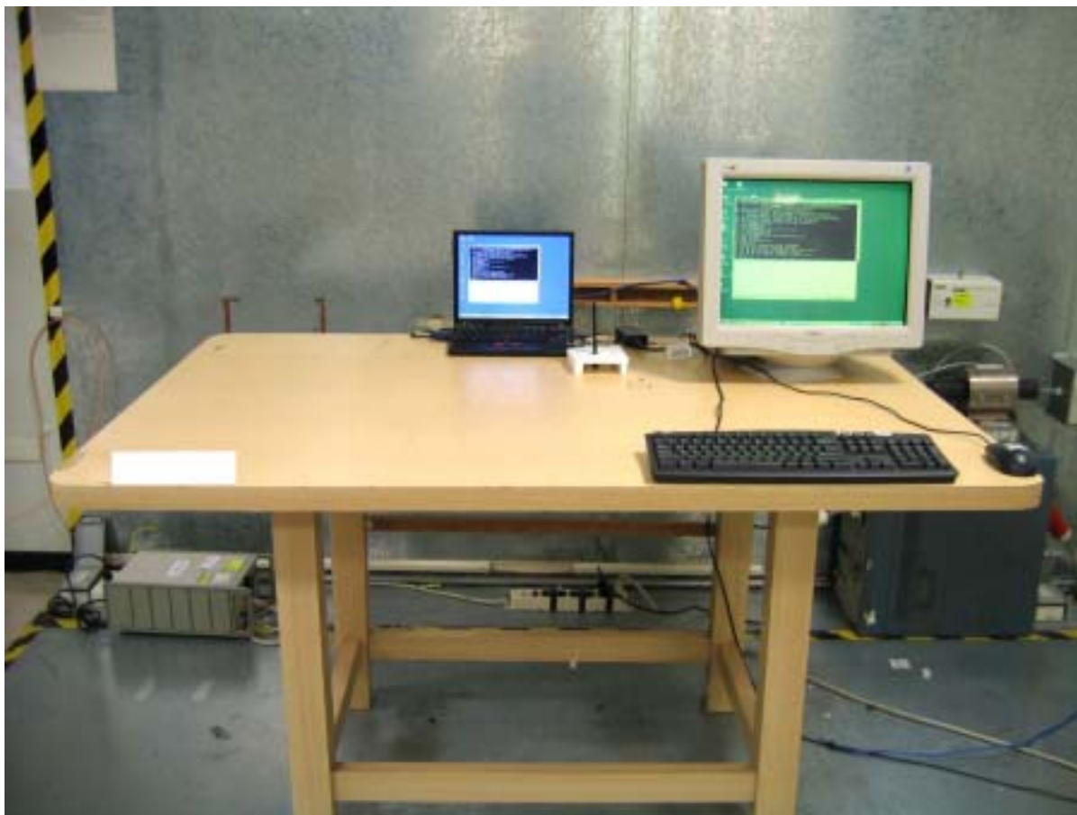
The Front View of Highest Conducted Set-up For EUT