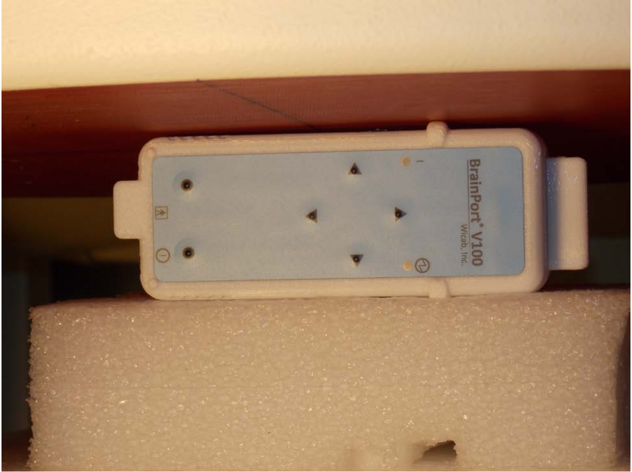
Test Position Side C 0 mm Gap