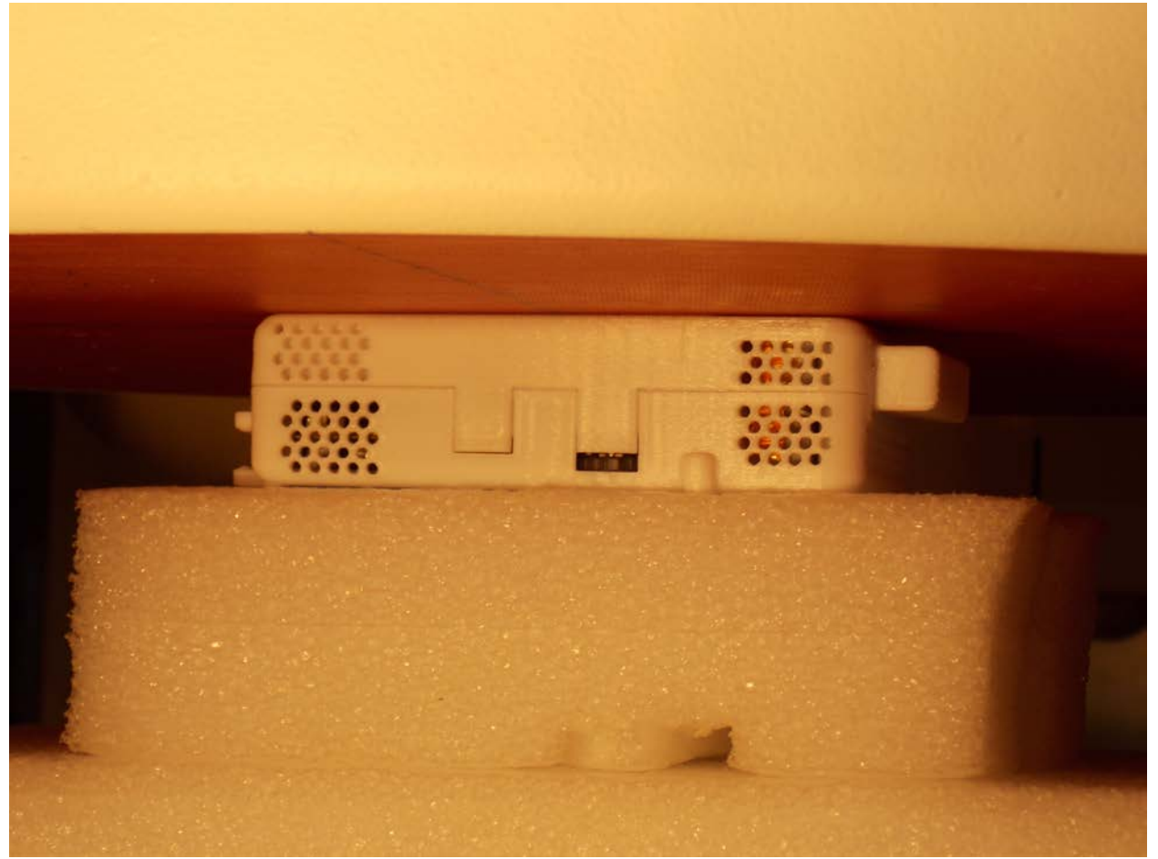
Test Position Side A 0 mm Gap