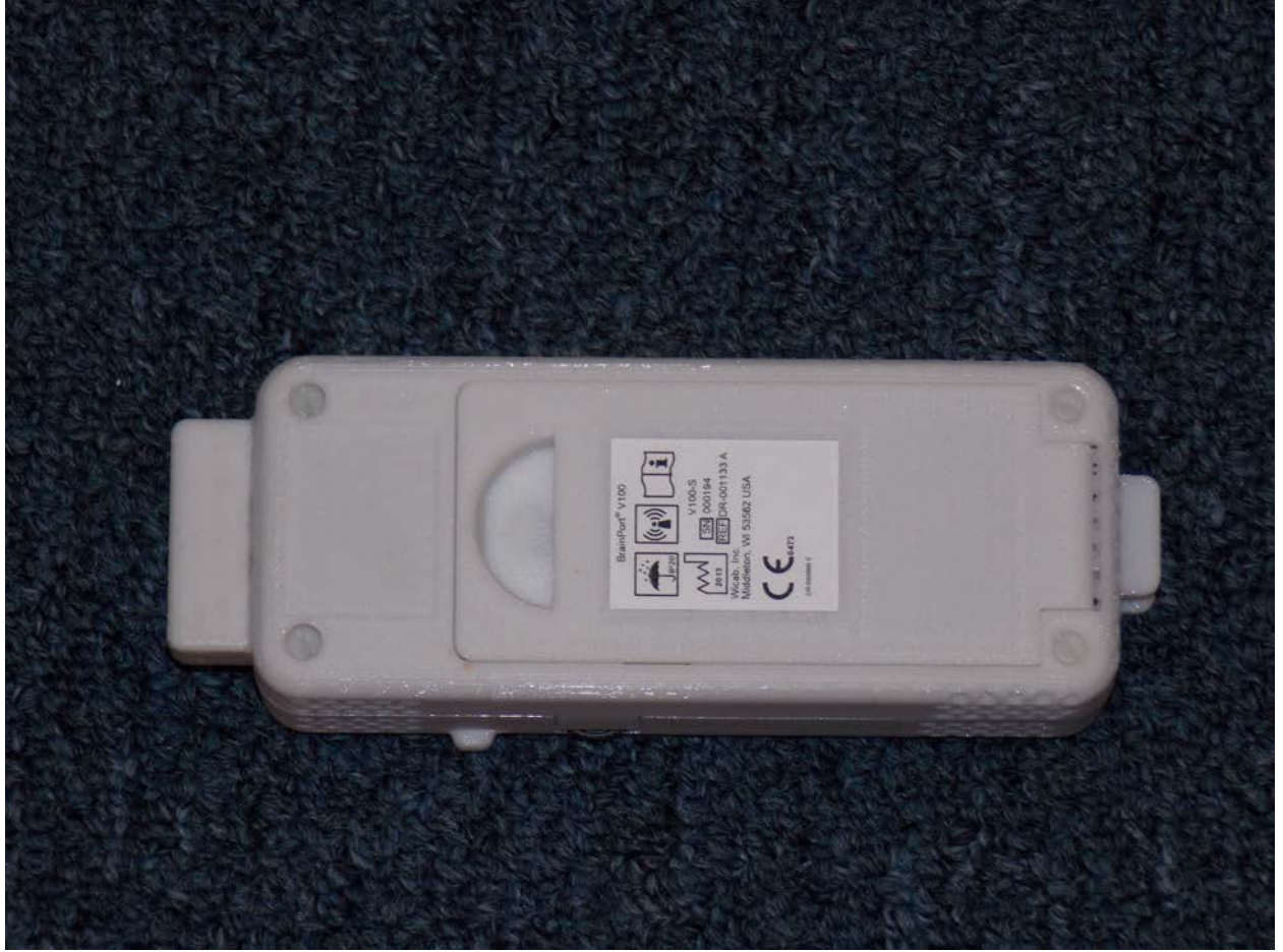
Back of Device