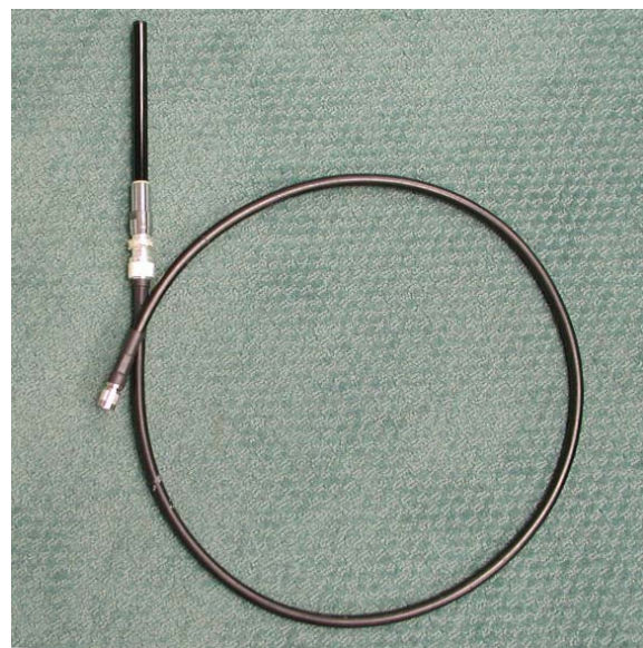
Figure 2. Completed assembly