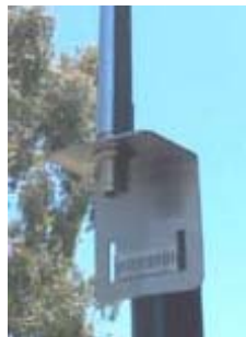
MB-100 Optional mast mount