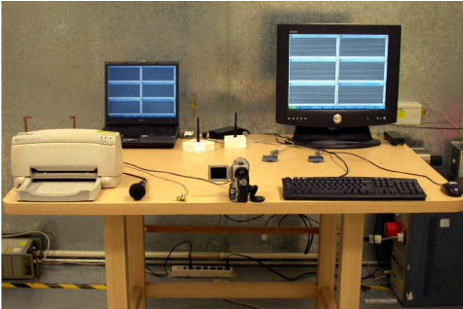
The Front View of Highest Conducted Set-up For EUT