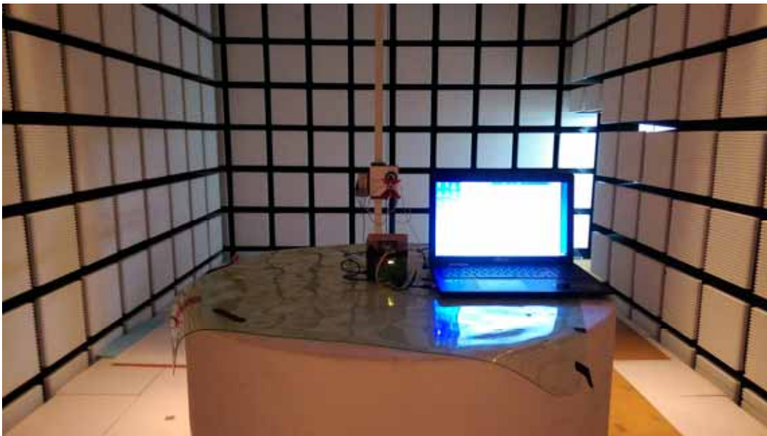
EUT on Lie