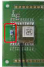
[ Testing Environment ]