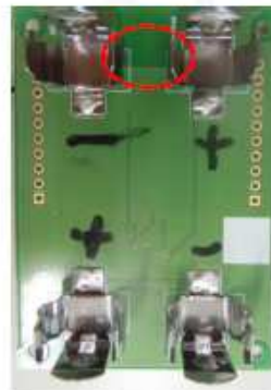
Back side: Battery holder