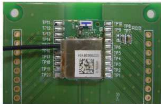
Module thickness : 1mm