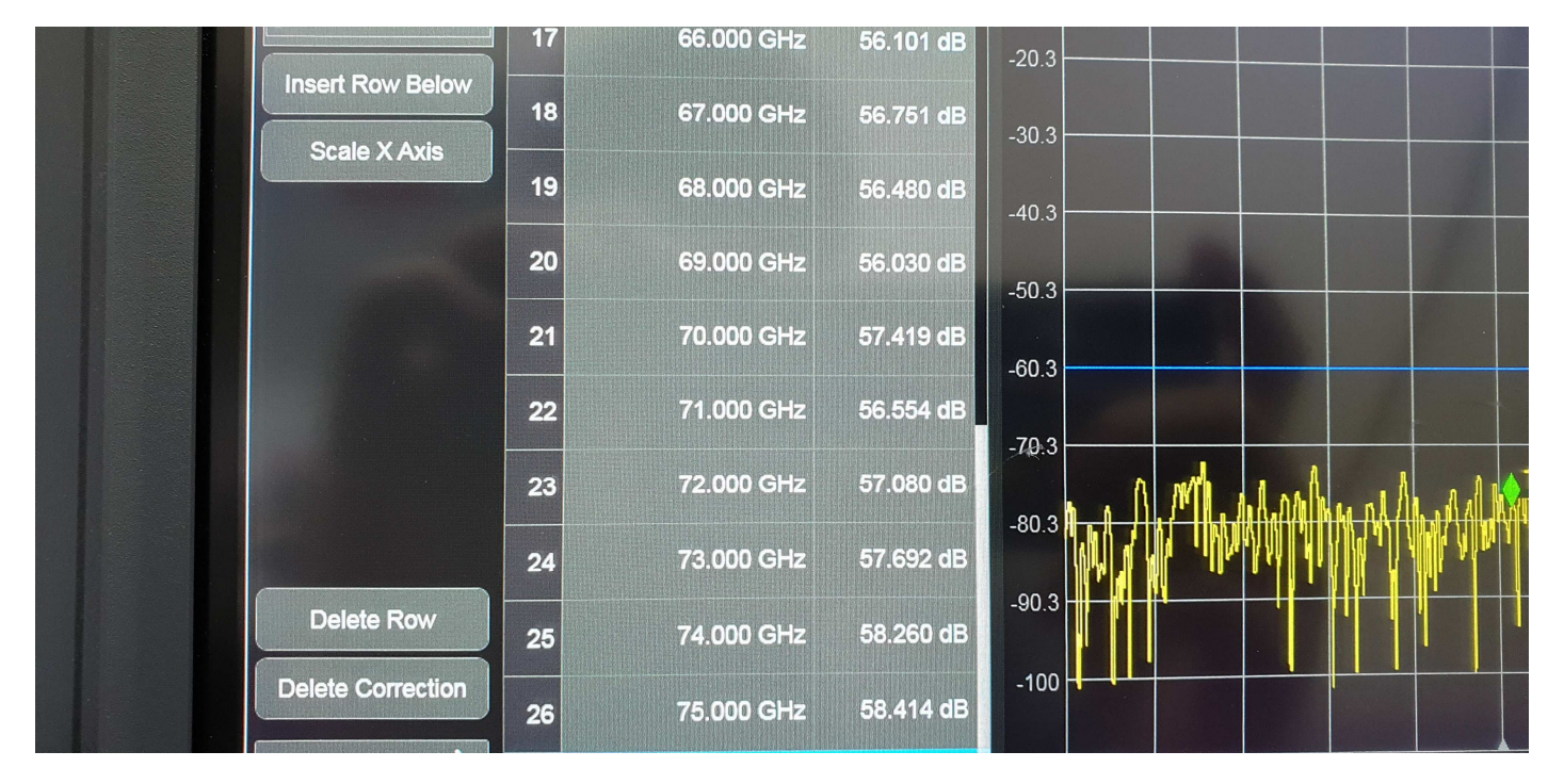
75GHz to 100GHz