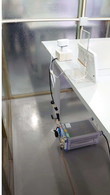
Side View 2

AC Conducted Emission - DECT Transmission and Charging with AC adaptor 1A101-1215-02