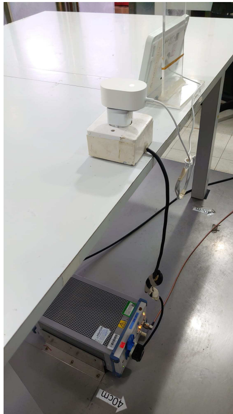
Side View 1