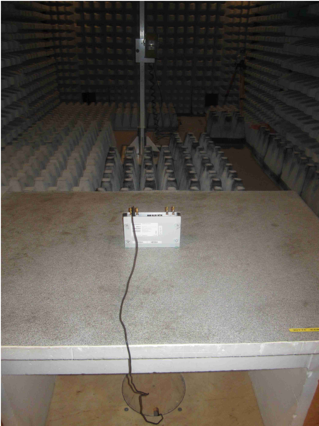
120195_03: Test setup - Radiated emission, Antennas terminated (fully anechoic chamber)