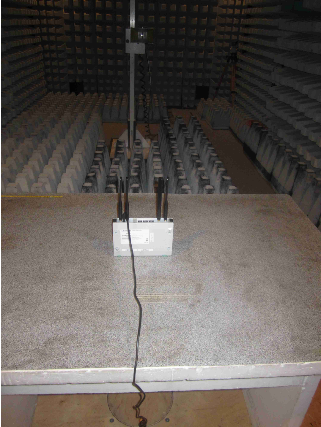
120195_05: Test setup - Radiated emission (fully anechoic chamber)