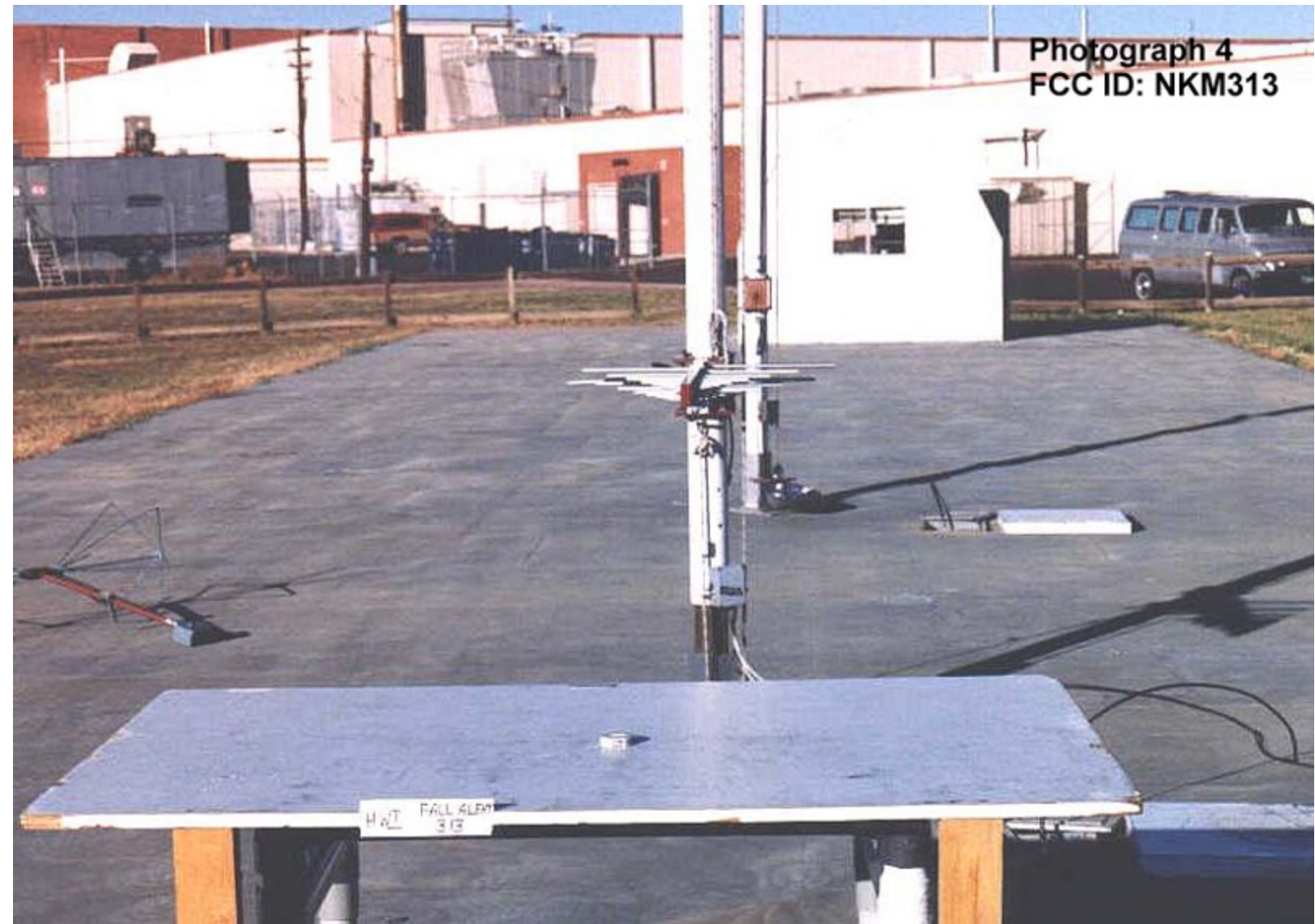
Photograph 4 FCC ID: NKM313