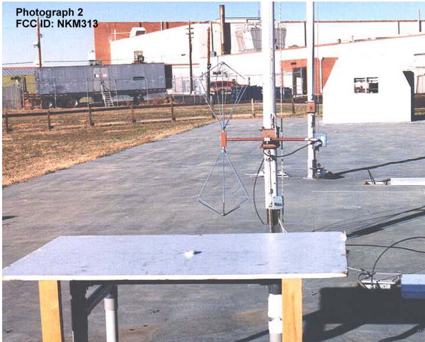
Photograph 2 FCC ID: NKM313