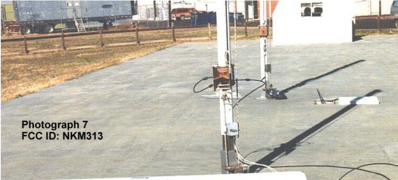
Photograph 7 FCC ID: NKM313