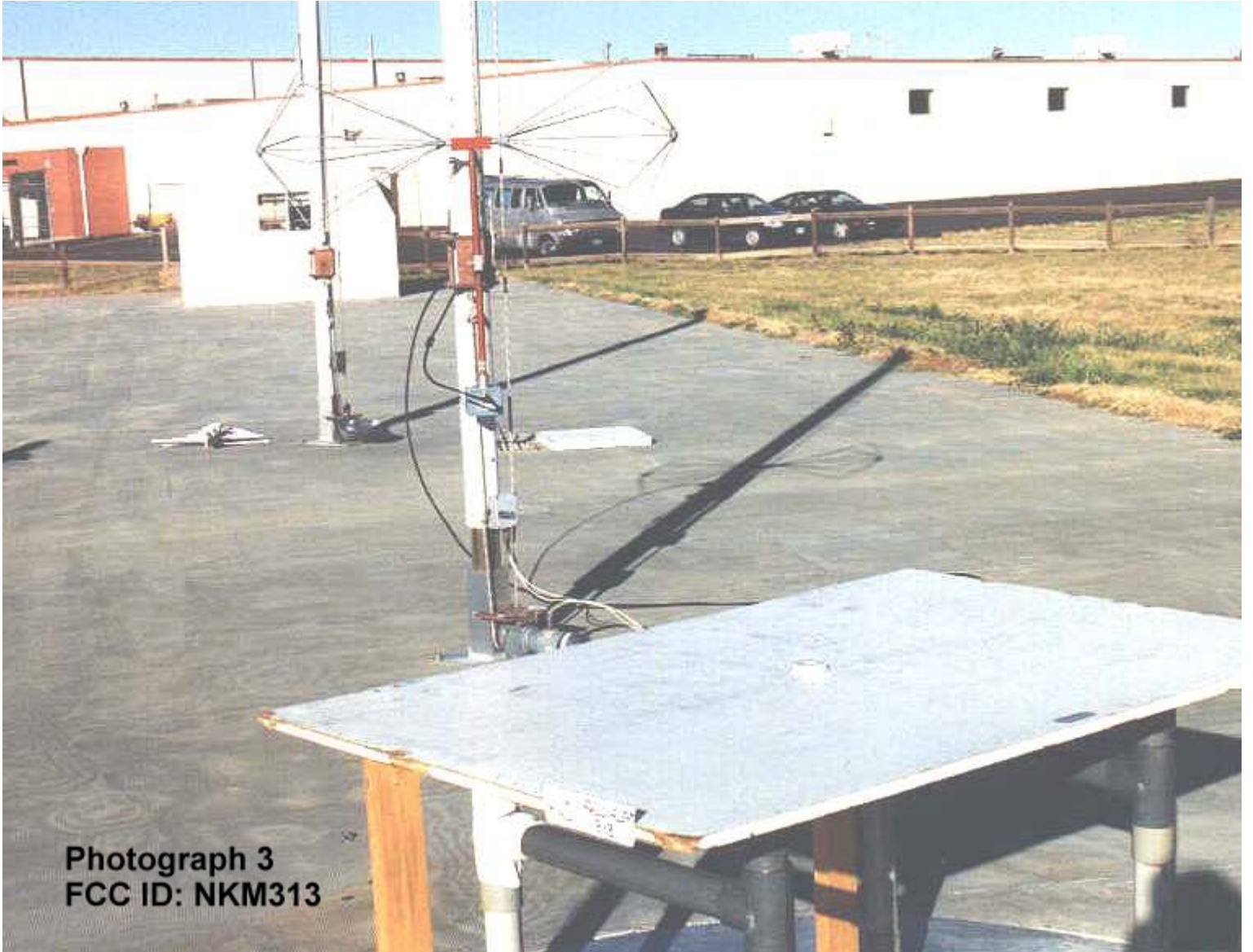
Photograph 3 FCC ID: NKM313