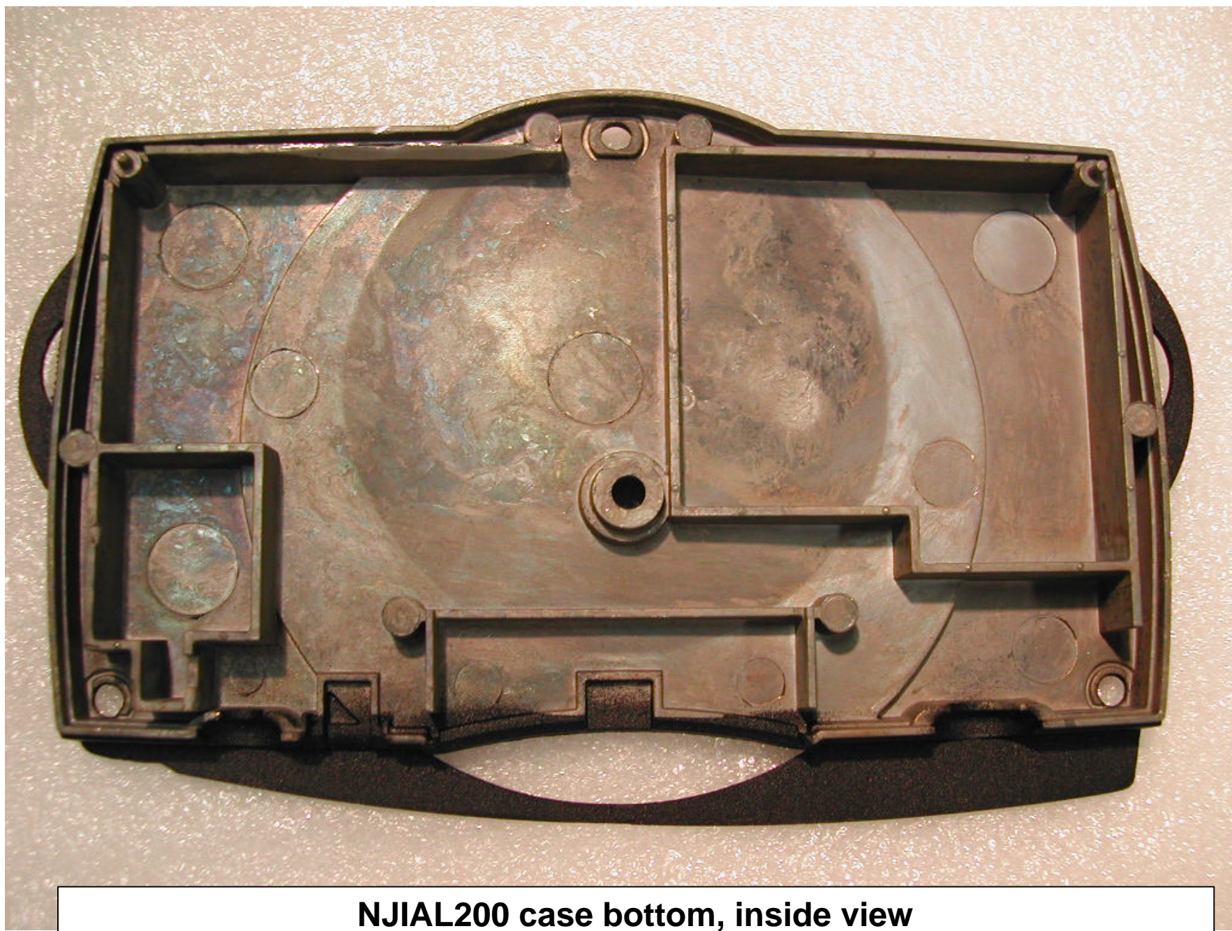
NJIAL200 case bottom, inside view