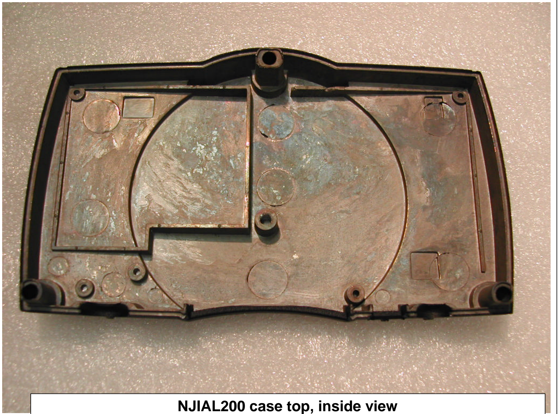
NJIAL200 case top, inside view