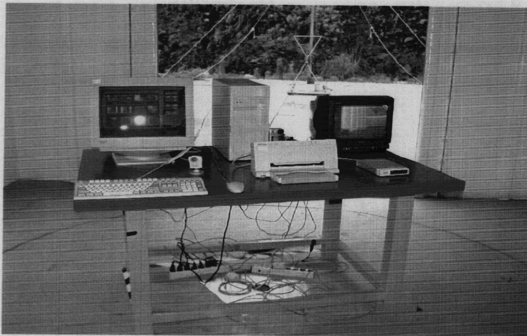
Back View of Radiated Test (Maximum Testing Configuration)