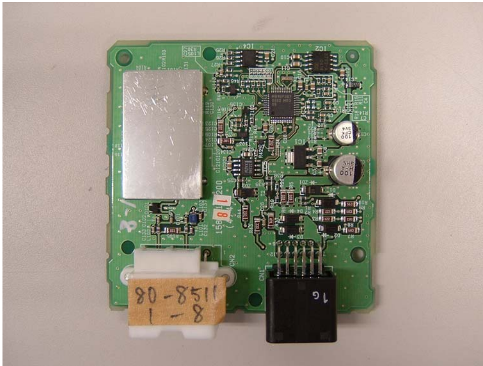
Receiver inside comp side with shield