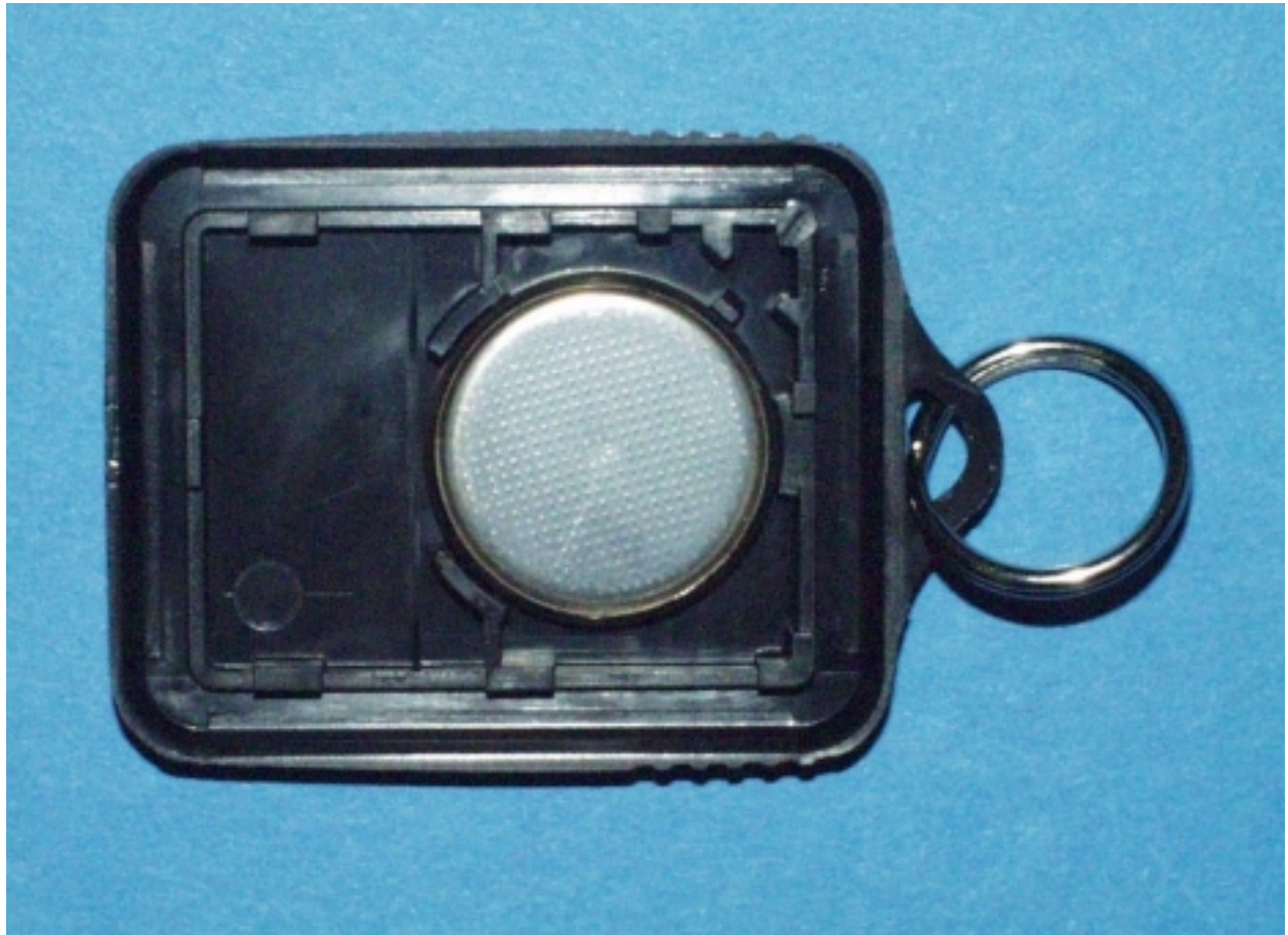
Inside Case, Back/Battery