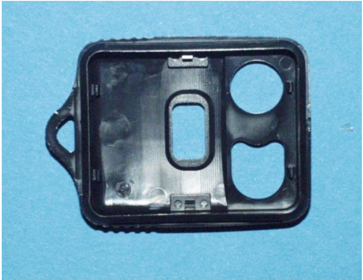
Inside Case, Front