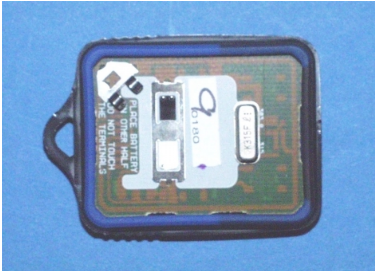
Circuit Board, Bottom