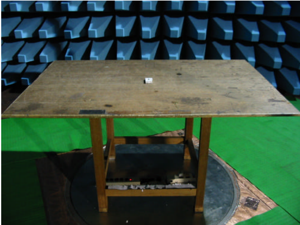
Front View of X-axis

(Worst case: Antenna Polarity Horizontal: X-axis, Antenna Polarity Vertical: Y-axis)