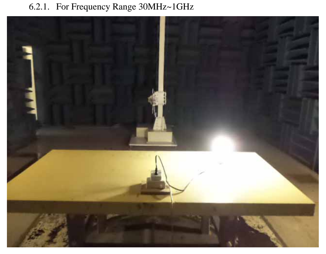
6.2.2. For Frequency Above 1GHz