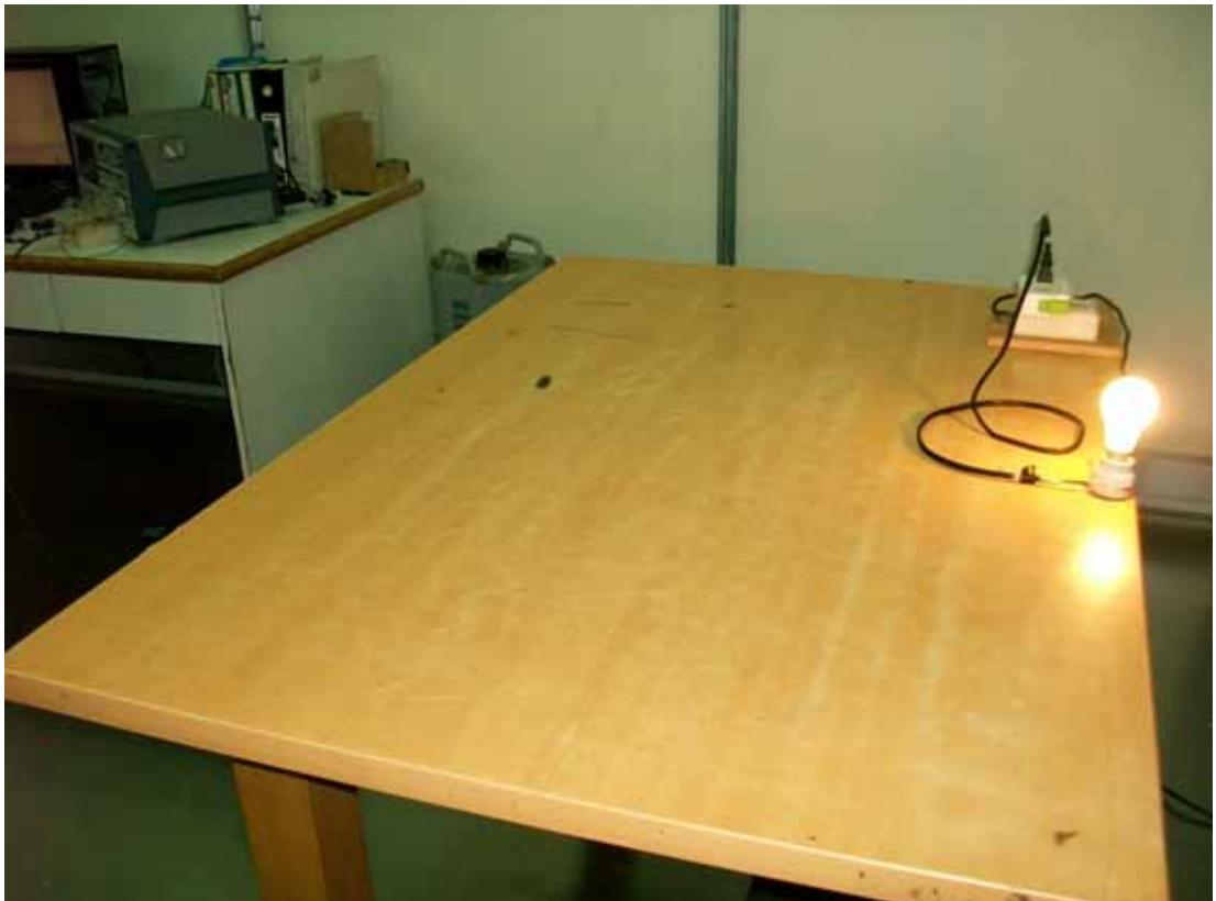
BACK VIEW OF CONDUCTED MEASUREMENT