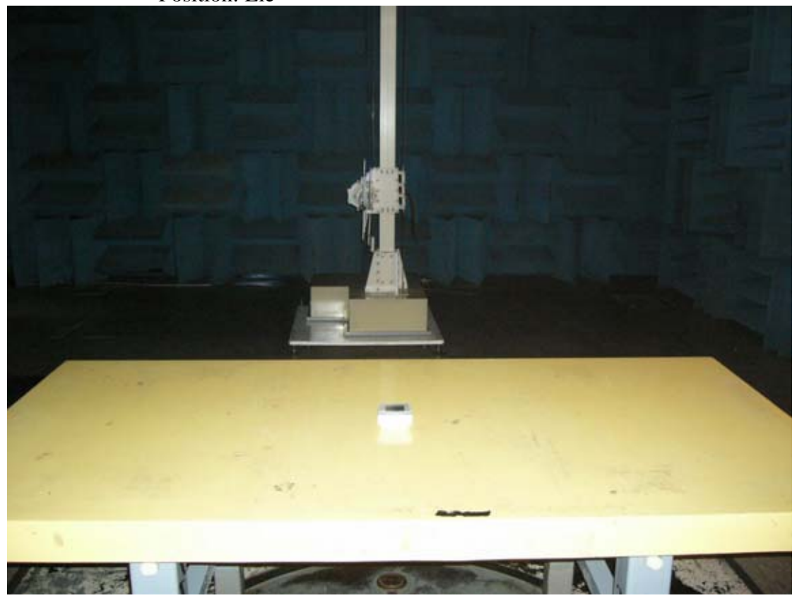
5.1.2. Frequency Above 1GHz