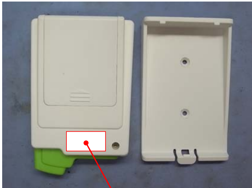
ID Label Placement Location