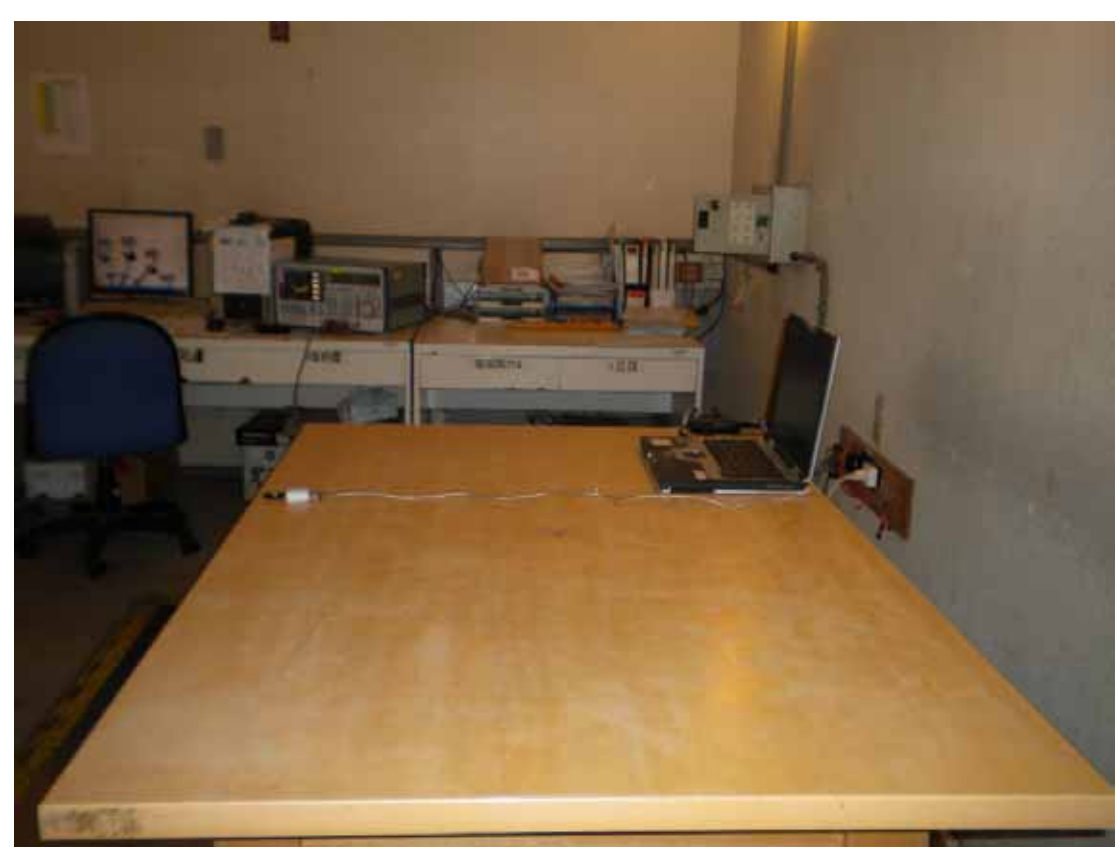
SIDE VIEW OF CONDUCTED MEASUREMENT