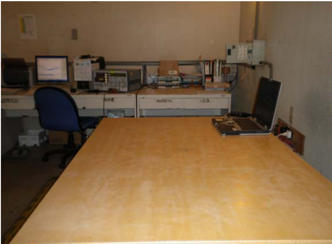
SIDE VIEW OF CONDUCTED MEASUREMENT