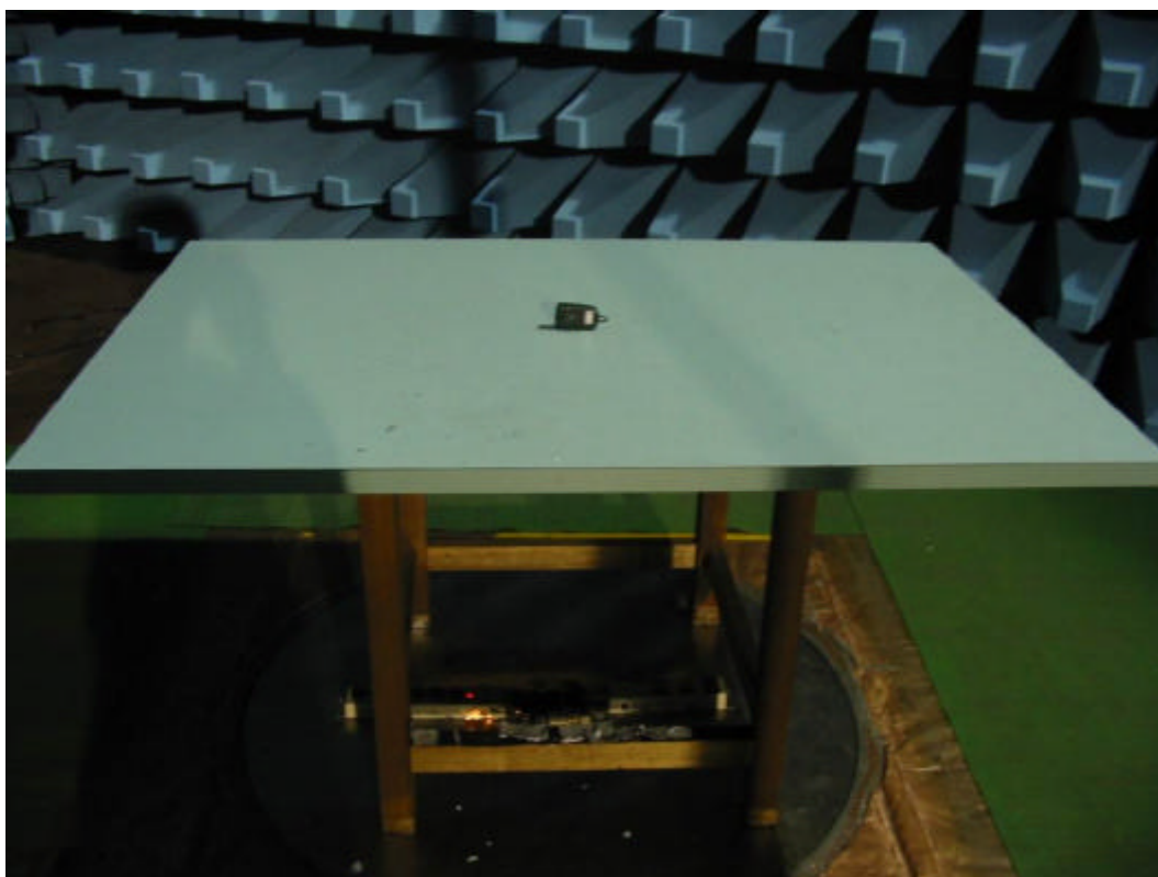
The Test configuration of Rear view of Z-axis