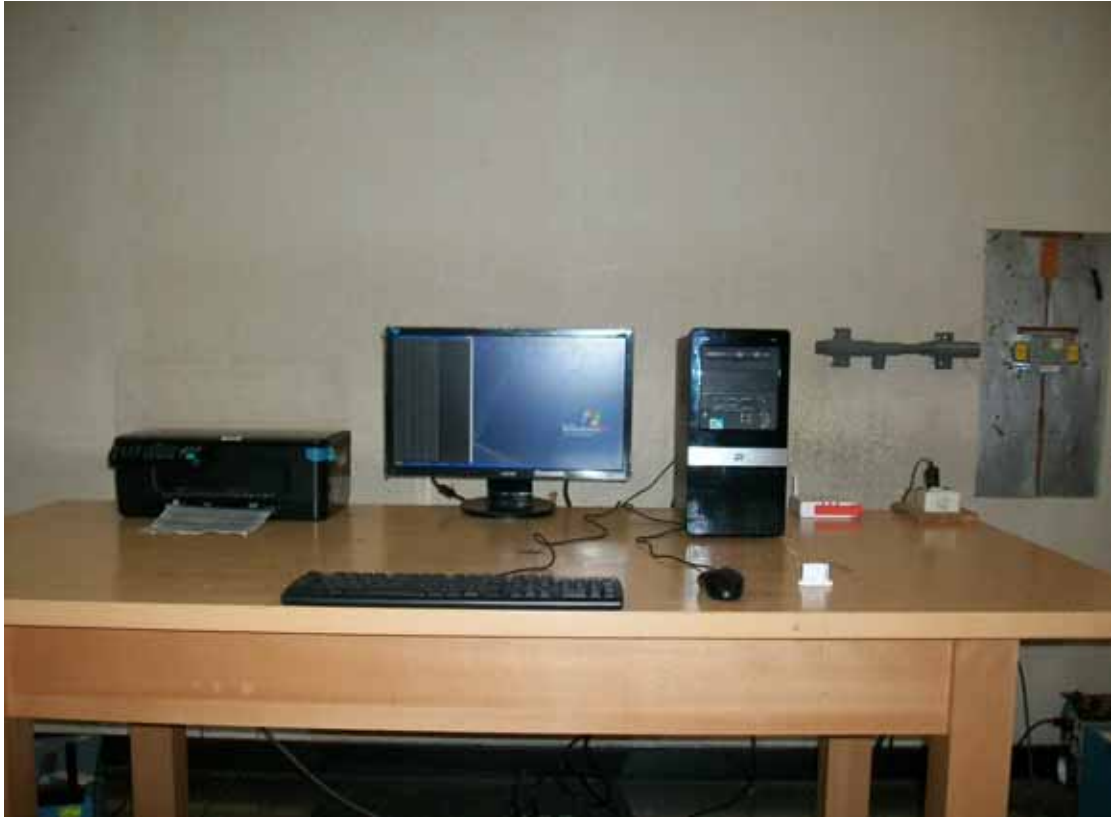
FRONT VIEW OF CONDUCTED MEASUREMENT