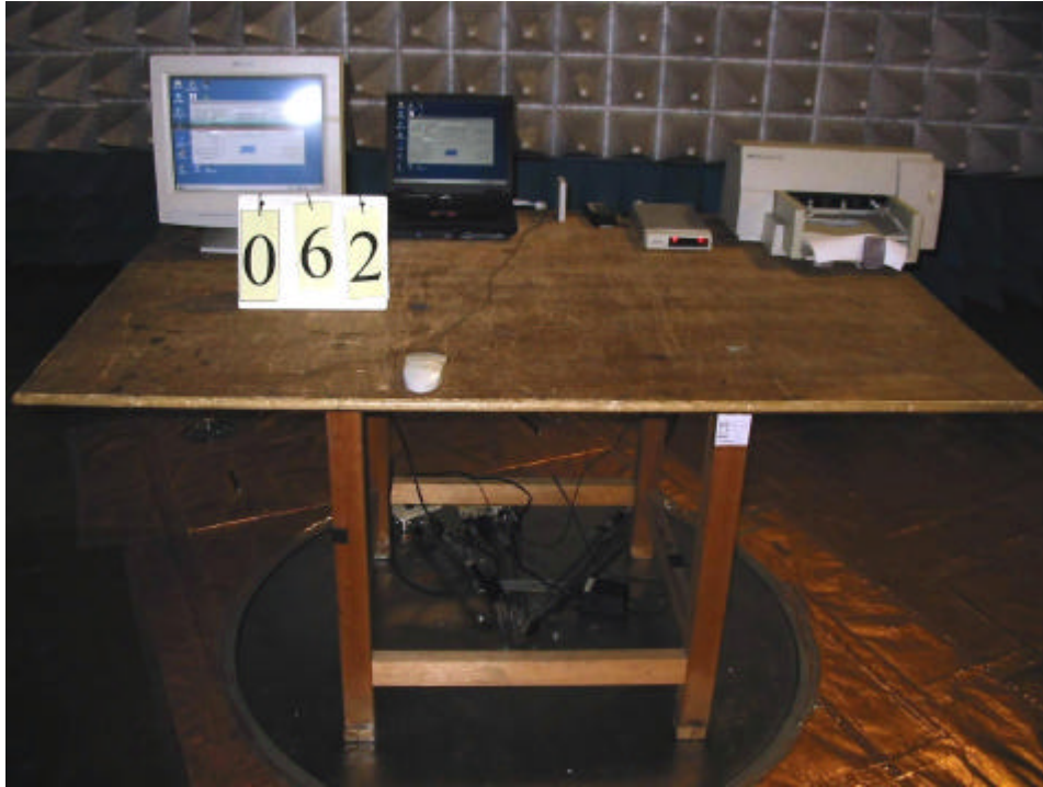
Front View of the Test Configuration of Unintentional