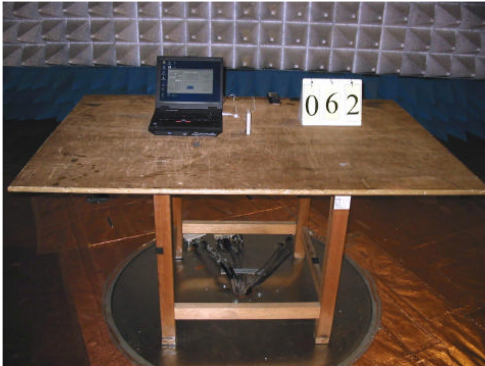
Front View of the Test Configuration of Intentional