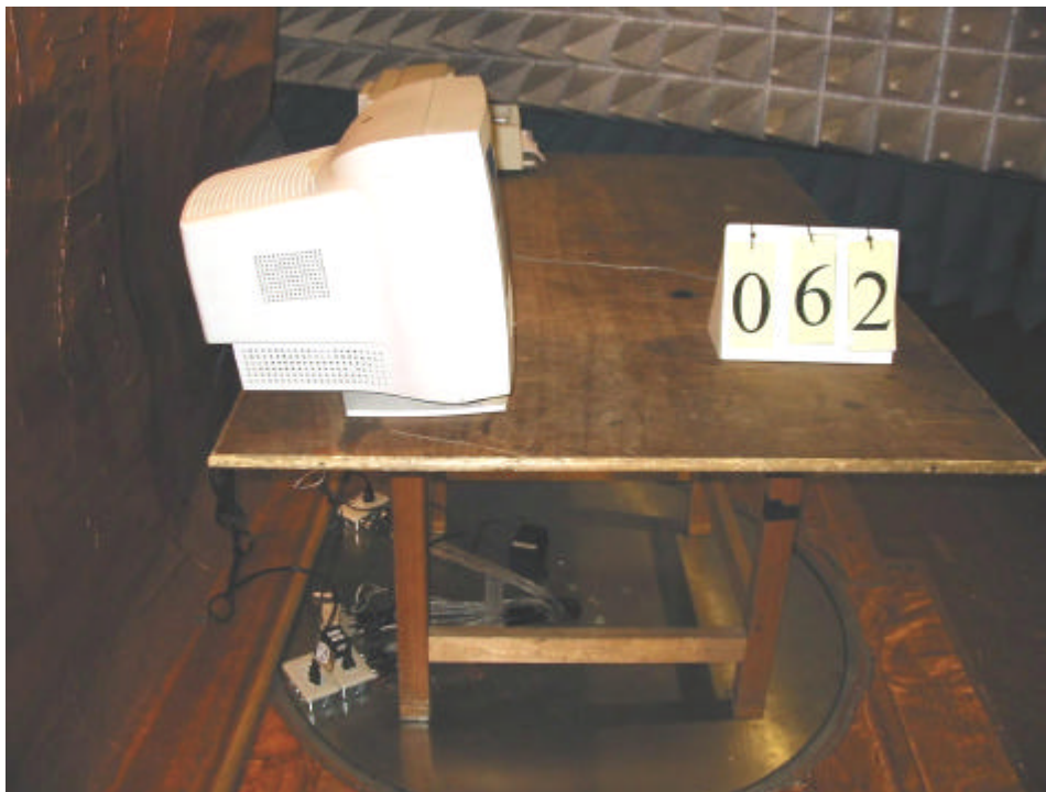
Side View of the Test Configuration