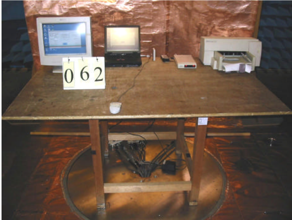
Front View of the Test Configuration