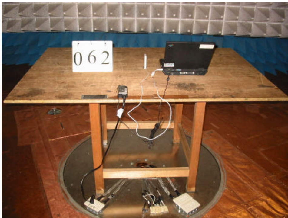
Rear View of the Test Configuration of Intentional