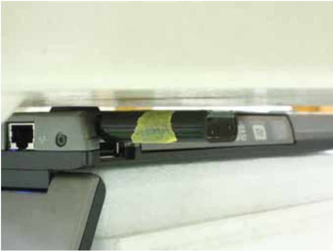
Horizontal Up with 0.5 cm Gap