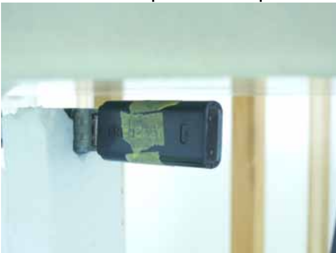
Vertical Front with 0.5 cm Gap