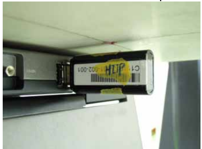
Vertical Back with 0.5 cm Gap