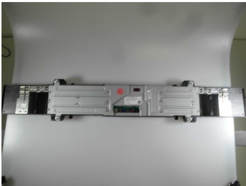
back antenna 1