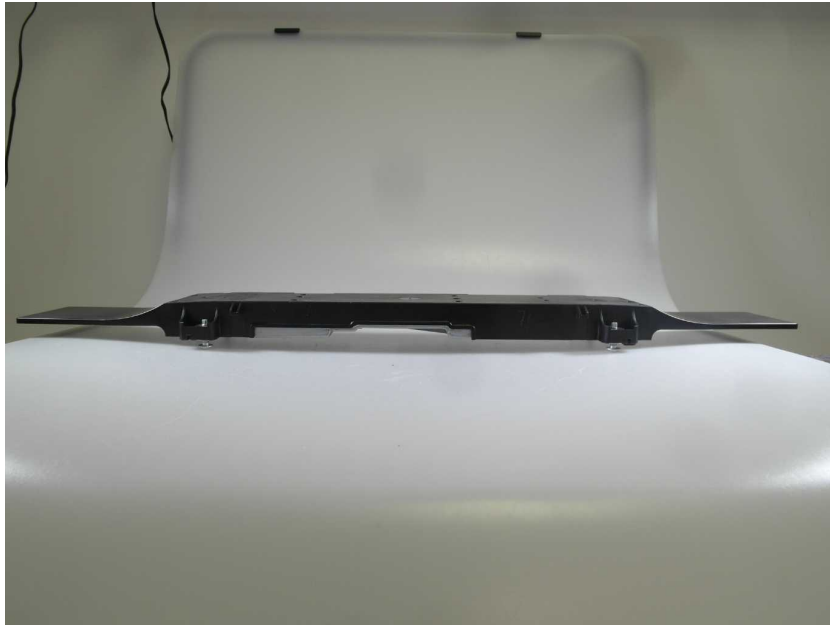
side view antenna 1