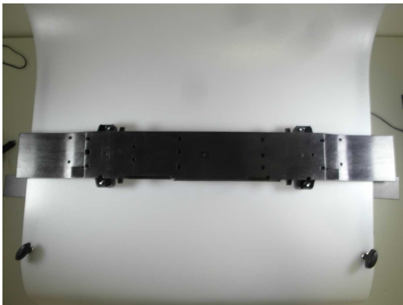
front antenna 1