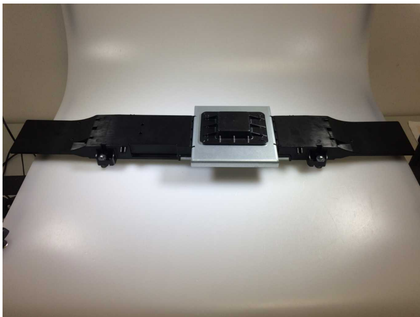
side view antenna 2