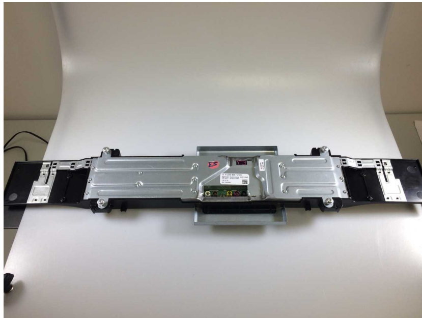
rear view antenna 2