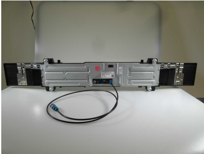
overview antenna 1