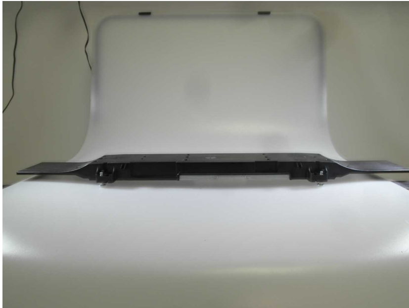
side view antenna 1