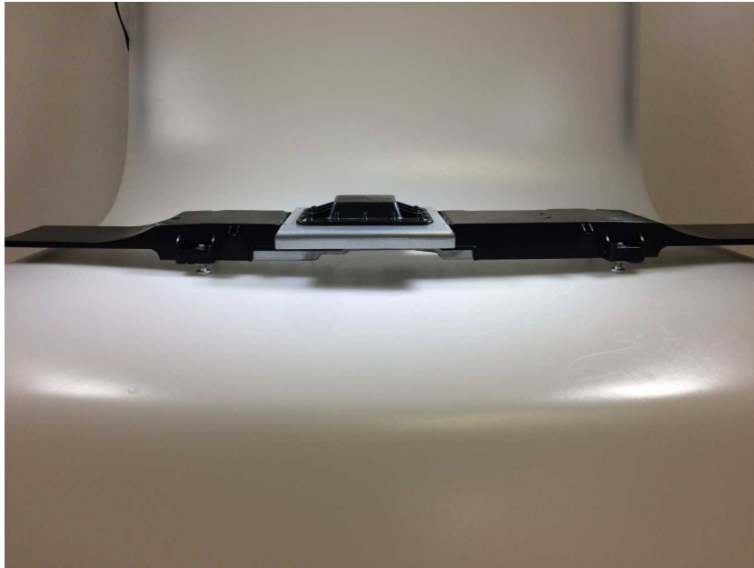
side view antenna 2