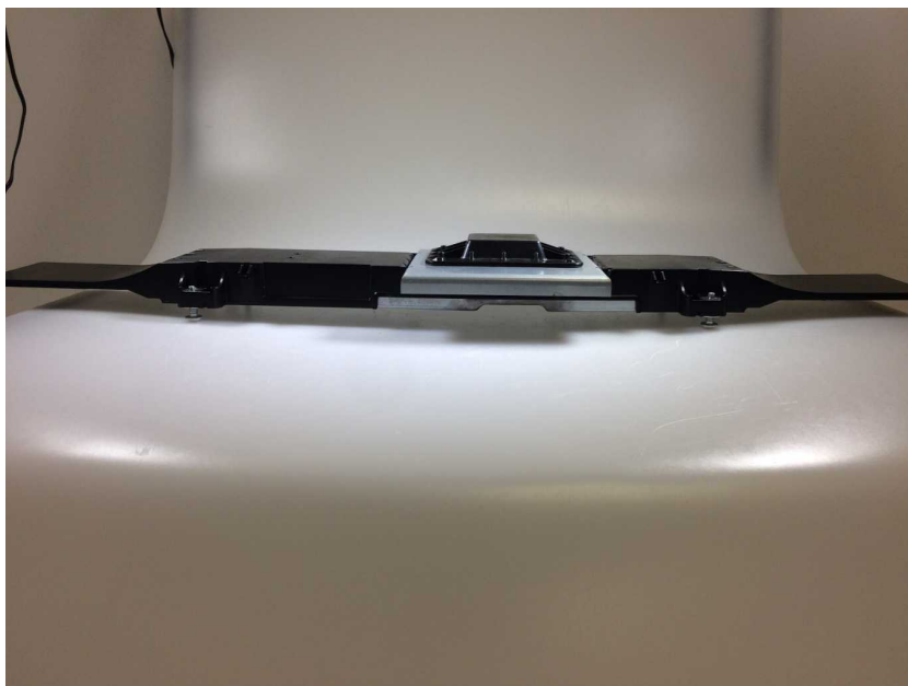
side view antenna 2