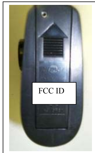
Figure 2.2 Location of the Label