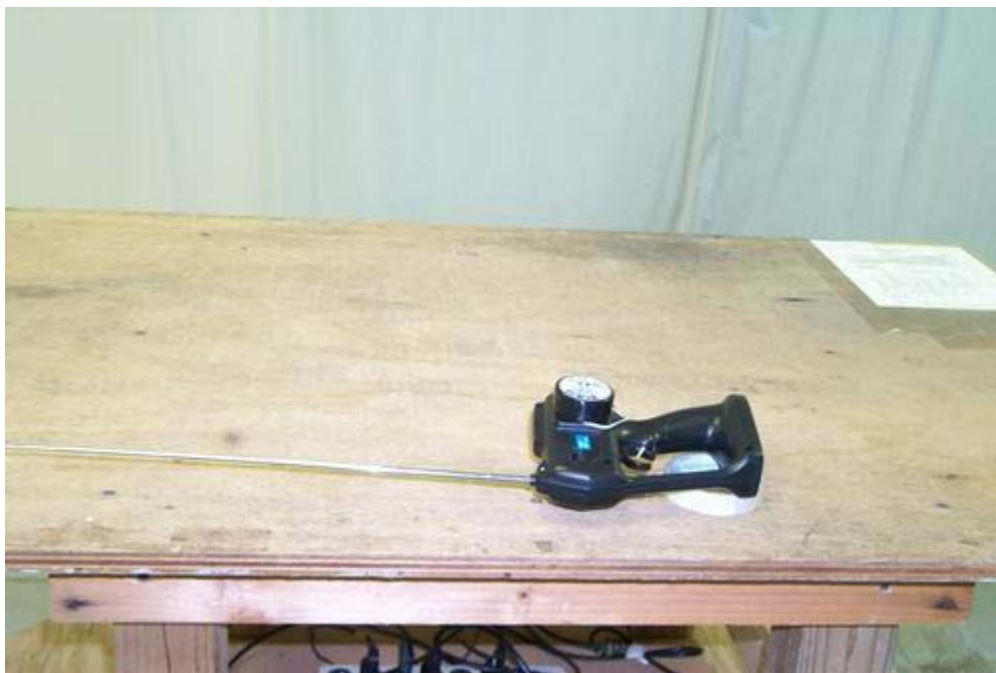
Figure 3.3 Radiated Test Setup, position 3