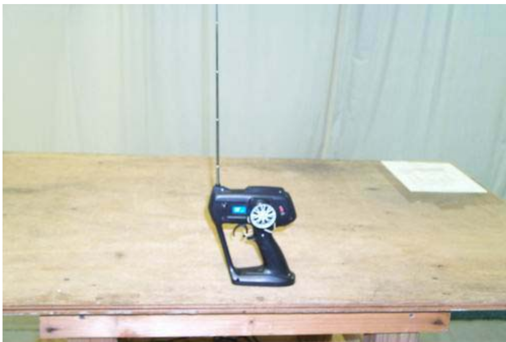
Figure 3.1 Radiated Test Setup, position 1