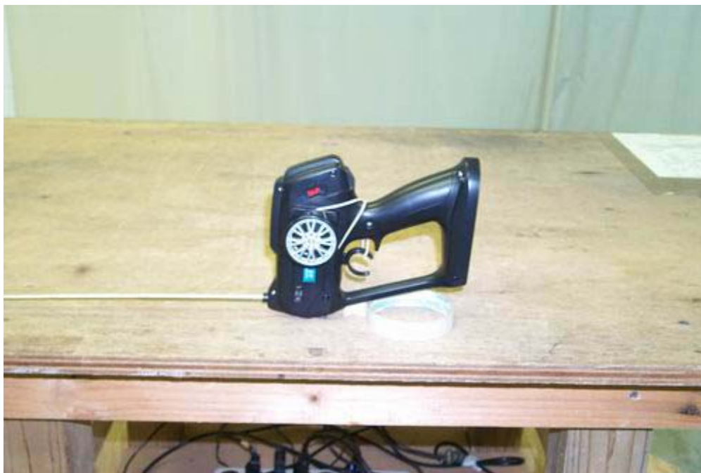
Figure 3.2 Radiated Test Setup, position 2