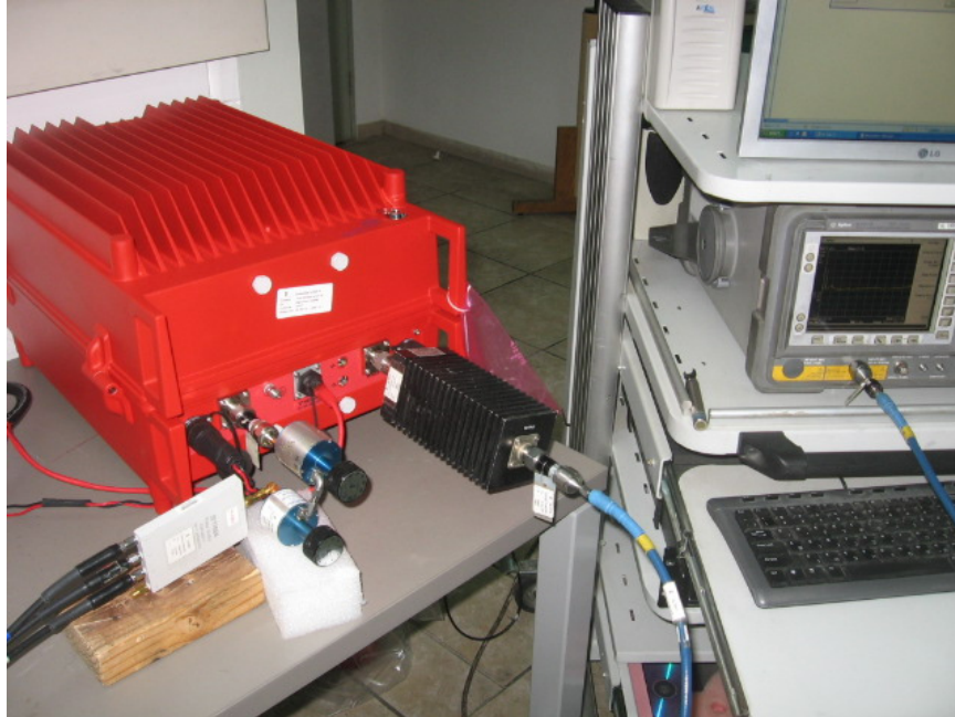
Photograph No.1 Mean output power, AGC threshold, occupied bandwidth, spurious emission measurement setup