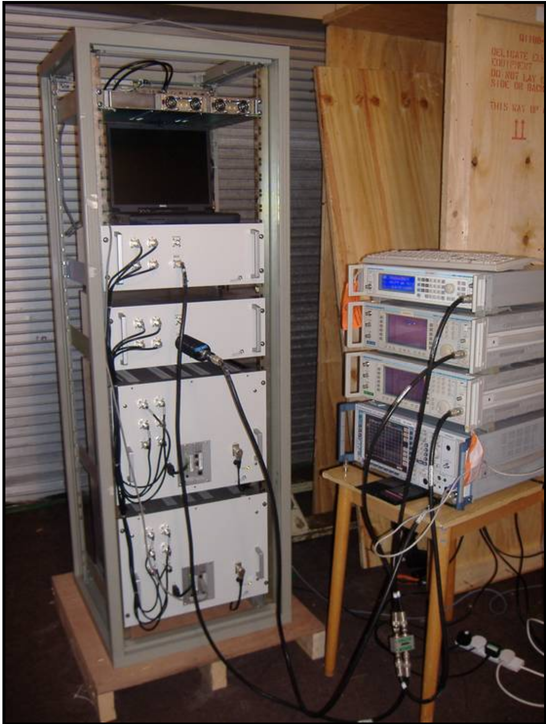
Conducted Test Setup