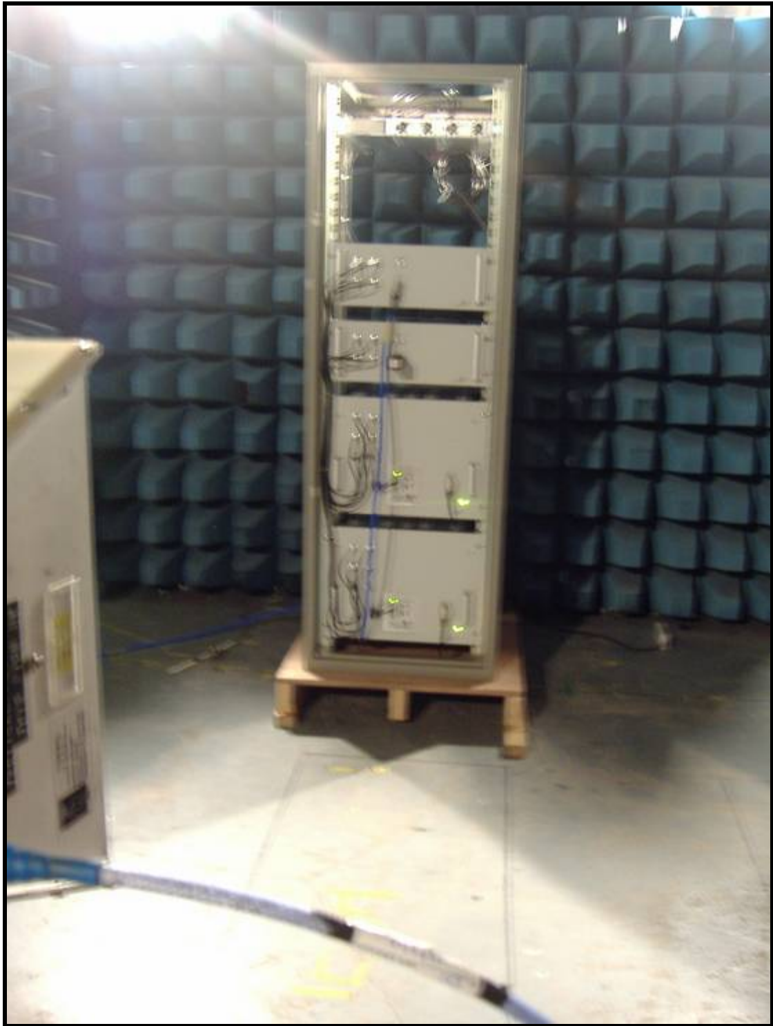
Radiated Test Setup (>1GHz)