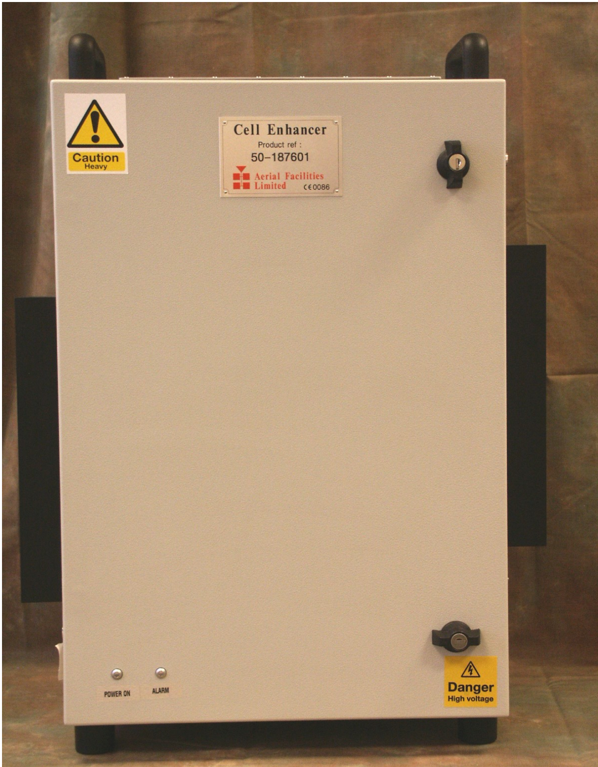
External front view, door closed