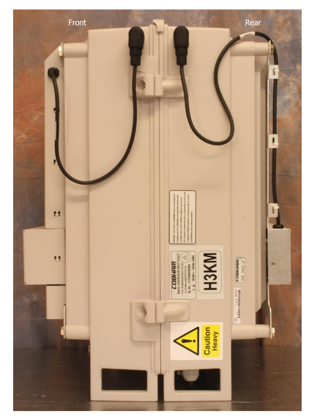
Figure 4 - Right-hand view

Printed Copy is Uncontrolled. A controlled version of this document may be accessed from the Cobham Wireless Q-Pulse Database.