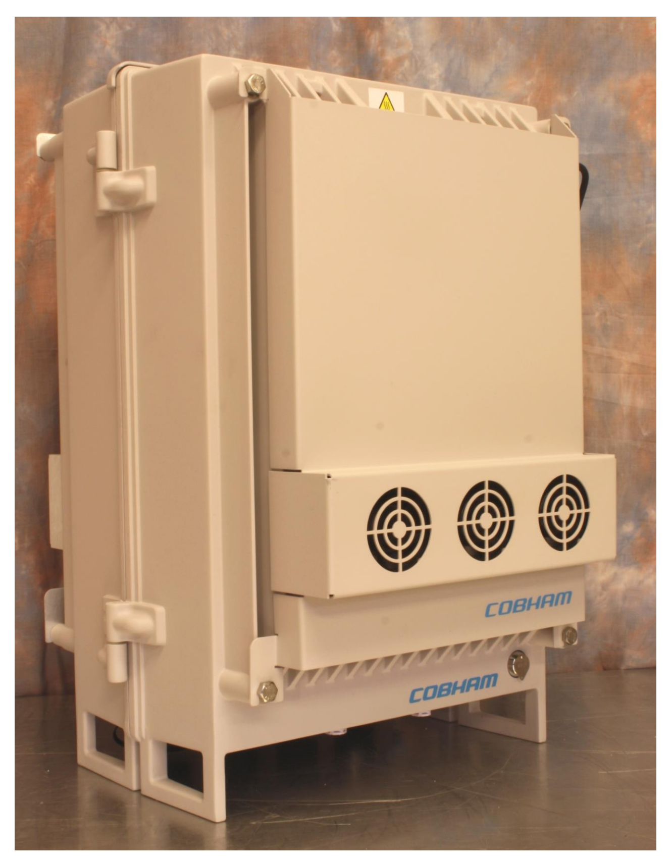
Figure 1 - Front three-quarter view

Title: idDAS High Power Remote Unit NEO43ID7D8C17C19A External Photos Doc. №: NEO43ID7D8C17C19A-E Revision Nº: 2 Cobham Private