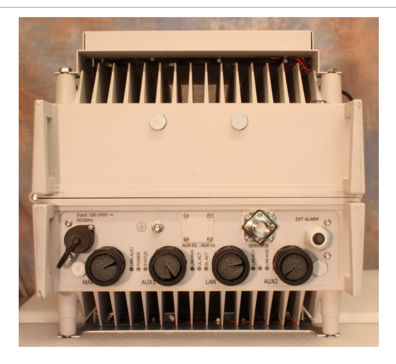
Figure 6 - Underside/interfaces view