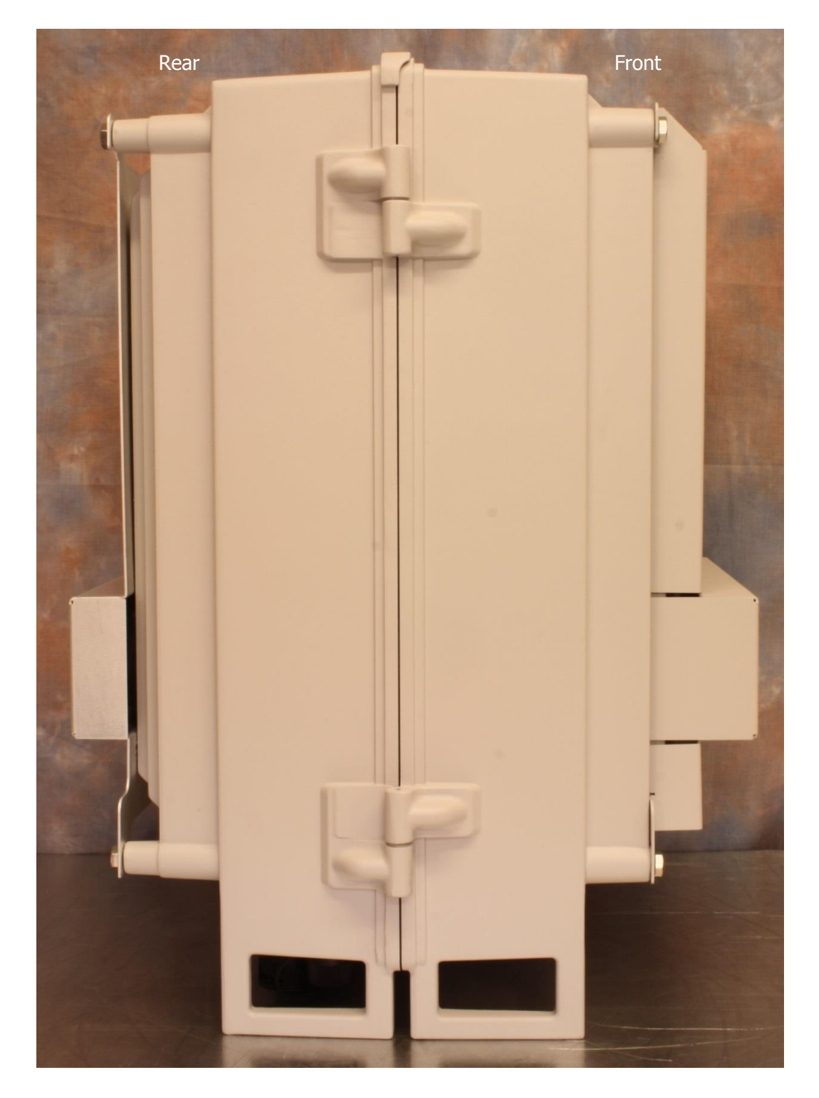
Figure 5 - Left-hand view

Printed Copy is Uncontrolled. A controlled version of this document may be accessed from the Cobham Wireless Q-Pulse Database.