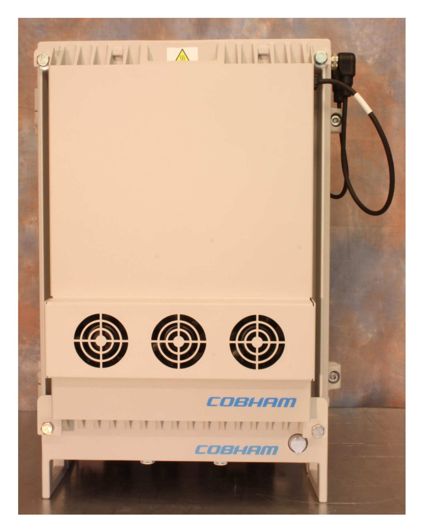
Figure 2 - Front view

Title: idDAS High Power Remote Unit NEO43ID7D8C17C19A External Photos Doc. №: NEO43ID7D8C17C19A-E Revision Nº: 2 Cobham Private