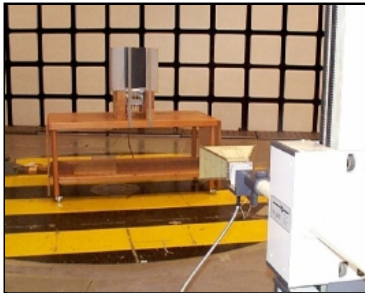
Fig. 2 – Photograph of the anechoic chamber with EUT. The antenna is shown on the right side.