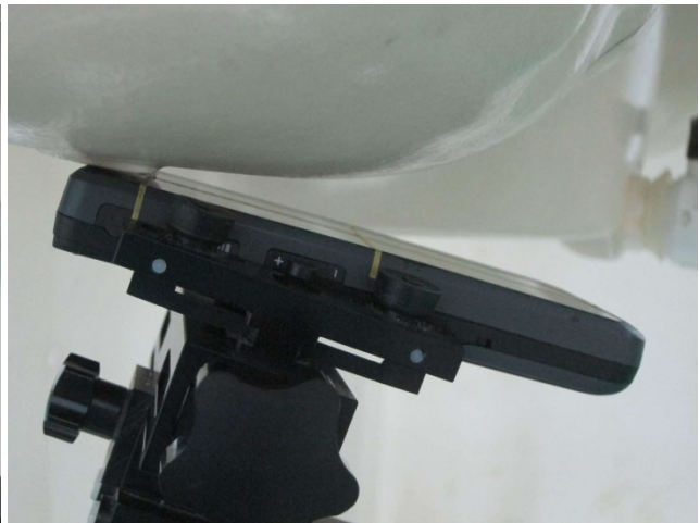
Right Tilted for sample 1