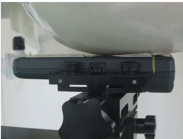
Left Cheek for sample 3