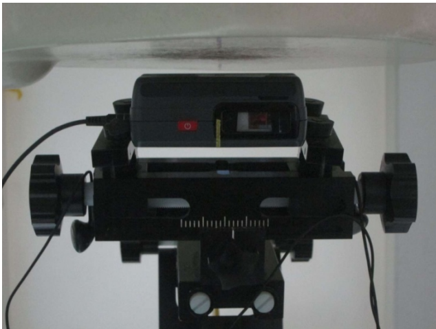
Back of the DUT with Phantom 1 cm Gap with earphone for sample 3