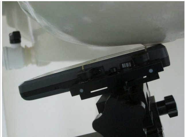
Left Tilted for sample 1