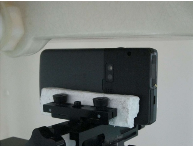
Right Side of the DUT with Phantom 1 cm Gap for sample 1