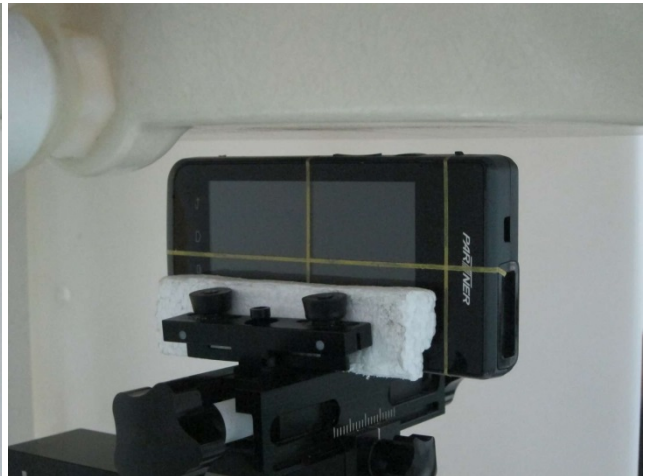
Left Side of the DUT with Phantom 1 cm Gap for sample 1