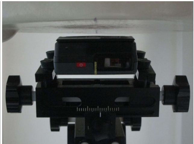
Back of the DUT with Phantom 1 cm Gap for sample 4