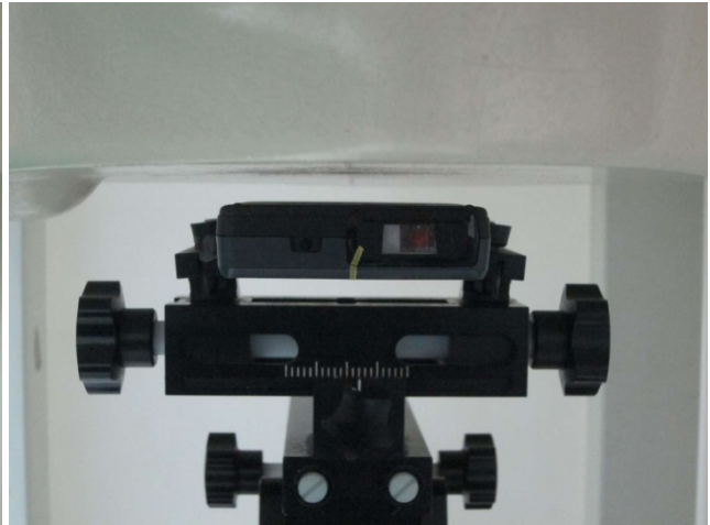
Back of the DUT with Phantom 1 cm Gap for sample 1