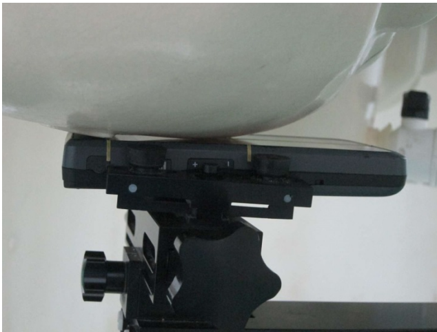
Right Cheek for sample 1