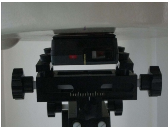
Back of the DUT with Phantom 0 cm Gap with earphone for sample 4