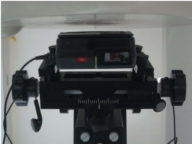
Back of the DUT with Phantom 1 cm Gap with earphone for sample 4