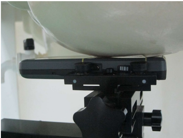
Left Cheek for sample 1