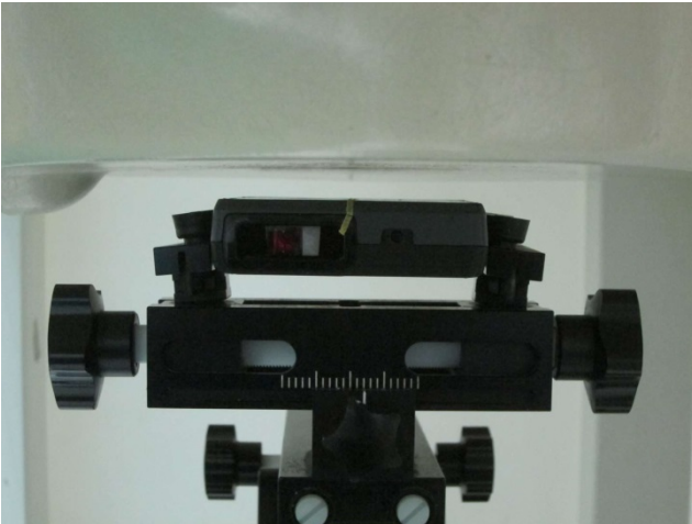
Front of the DUT with Phantom 1 cm Gap for sample 1