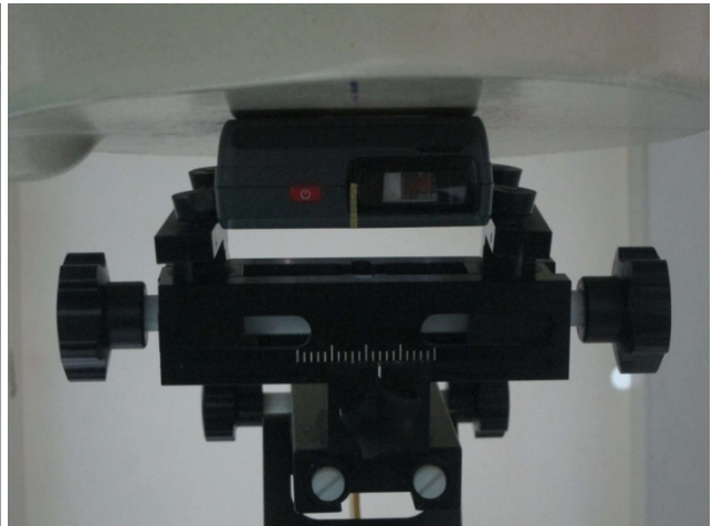
Back of the DUT with Phantom 0 cm Gap with earphone for sample 3