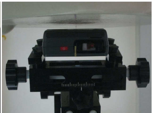
Back of the DUT with Phantom 1 cm Gap for sample 3