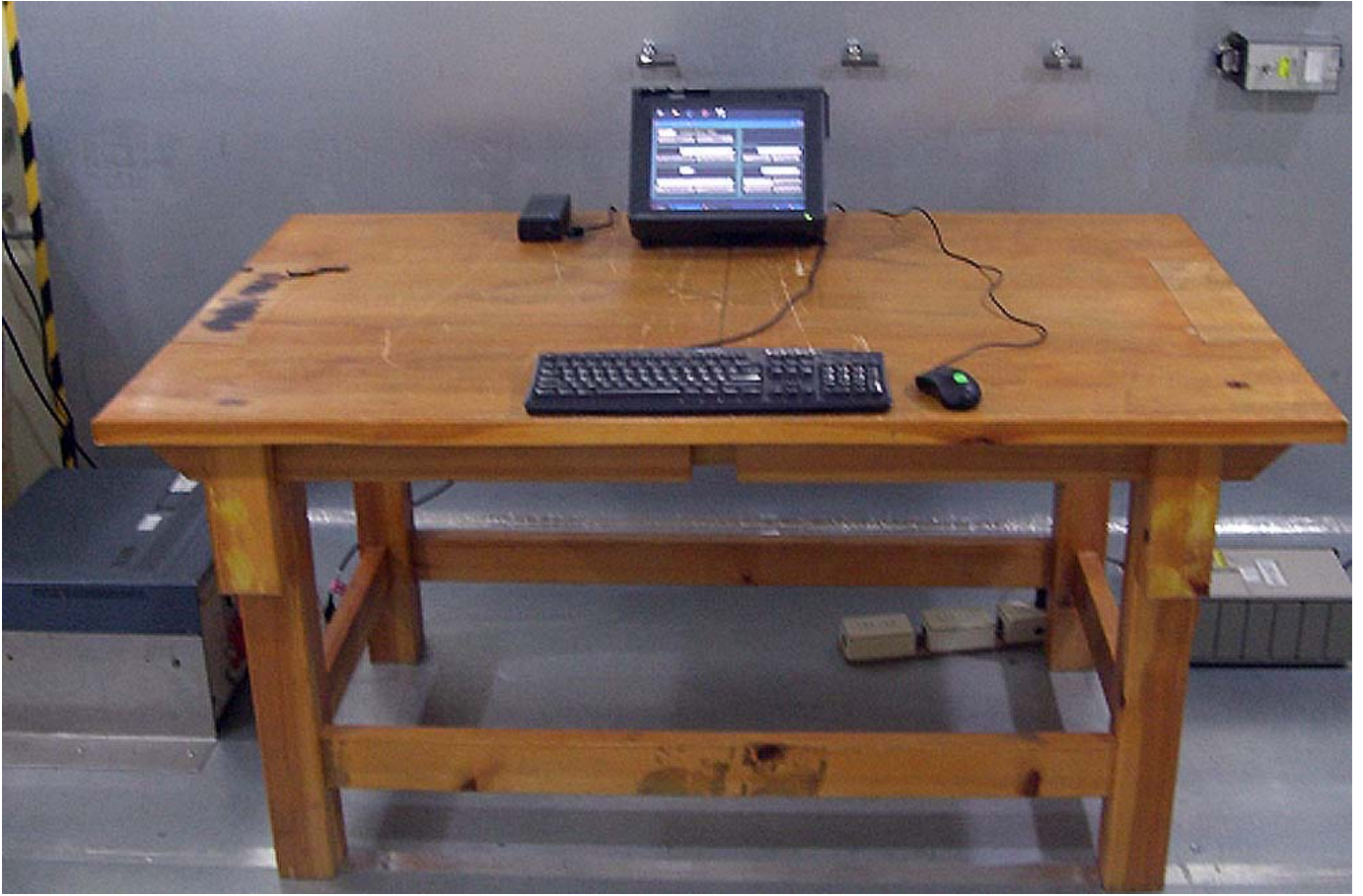
The Front View of Highest Conducted Set-up For EUT