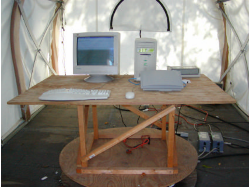
Conducted Emission - Rear View