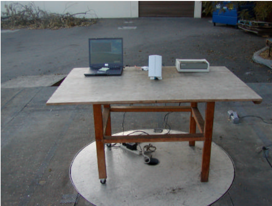
Radiated Emission - Rear View