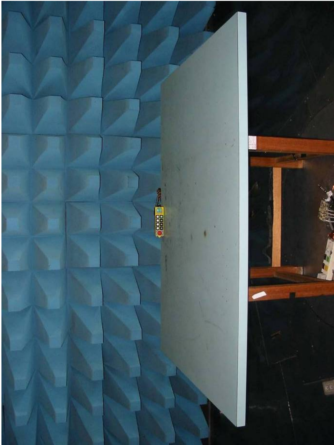
X - Photo