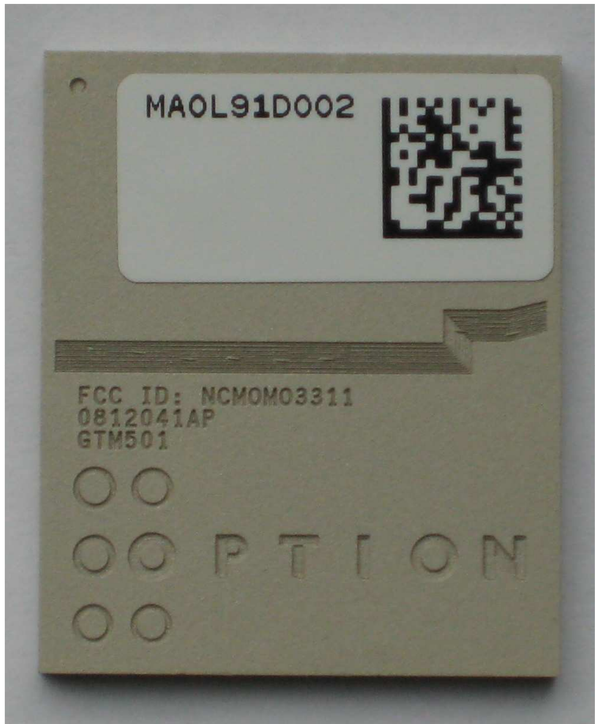
GTM501 front overmolded