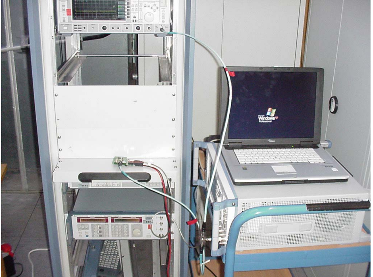
setup for conducted testing