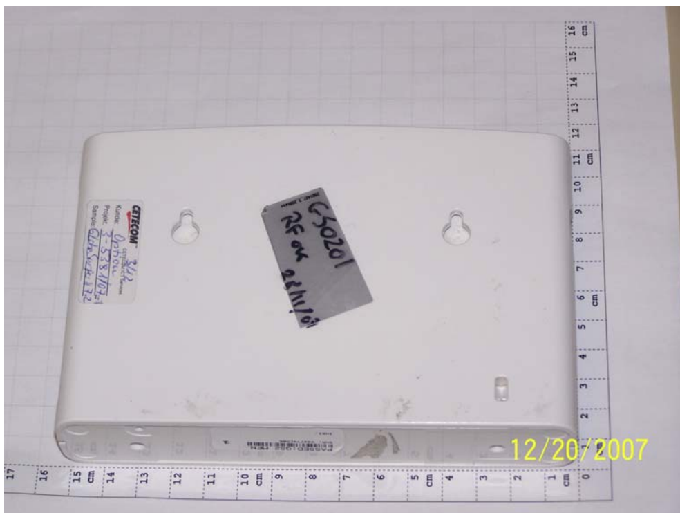
Photograph 2: Equipment under test: EUT A – rear side