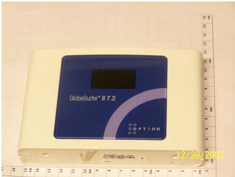
Photograph 1: Equipment under test: EUT A – front side