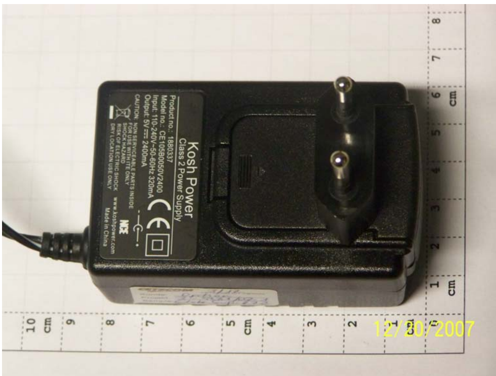
Photograph 4: Equipment under test: EUT C – Power Supply