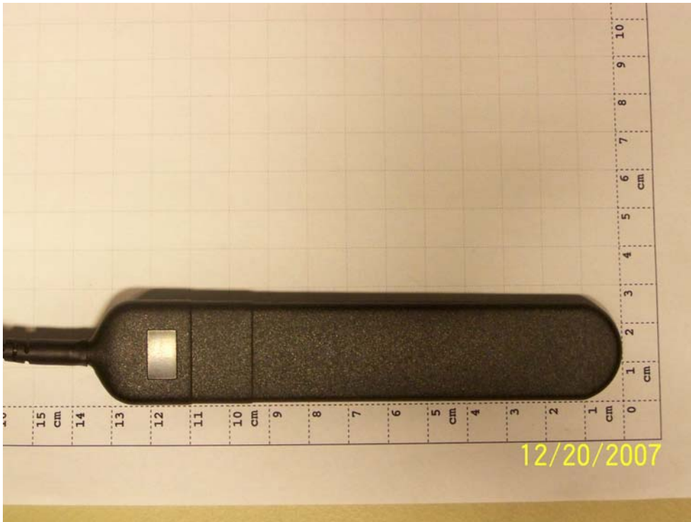
Photograph 3: Equipment under test: EUT B – External antenna