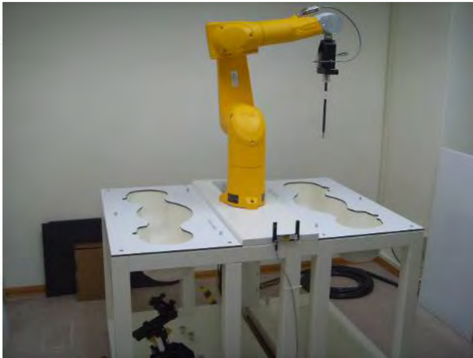
Fig.1 Photograph of the SAR measurement System