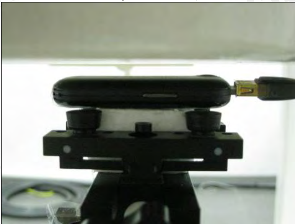
Fig 4: Horizontal-Down.

Unless otherwise stated the results shown in this test report refer only to the sample(s) tested and such sample(s) are retained for 90 days only. 除非另有說明，此報告結果僅對測試之樣品負責，同時此樣品僅保留 90 天。本報告未經本公司書面許可，不可部份複製。