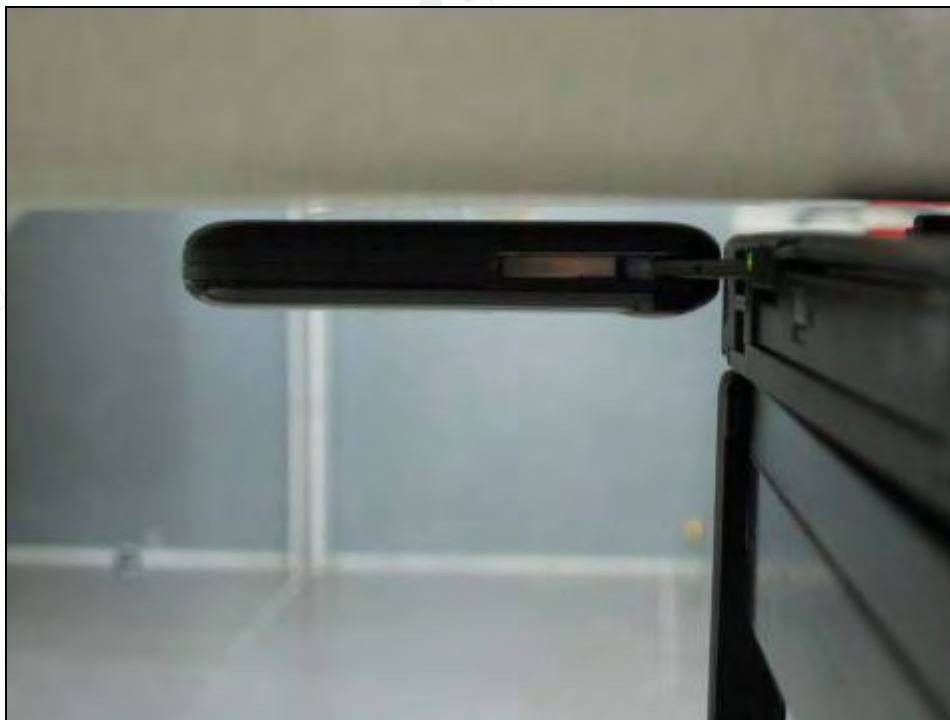
Fig 3 :Horizontal-Up.