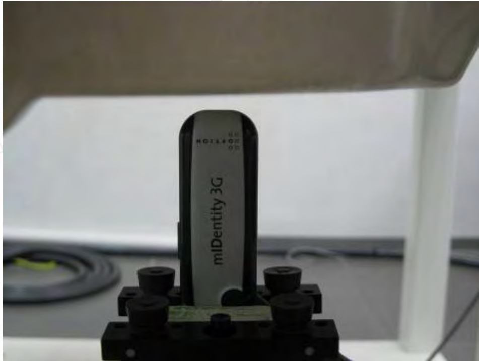
Fig 7 : Tip side.

Unless otherwise stated the results shown in this test report refer only to the sample(s) tested and such sample(s) are retained for 90 days only. 除非另有說明，此報告結果僅對測試之樣品負責，同時此樣品僅保留 90 天。本報告未經本公司書面許可，不可部份複製。