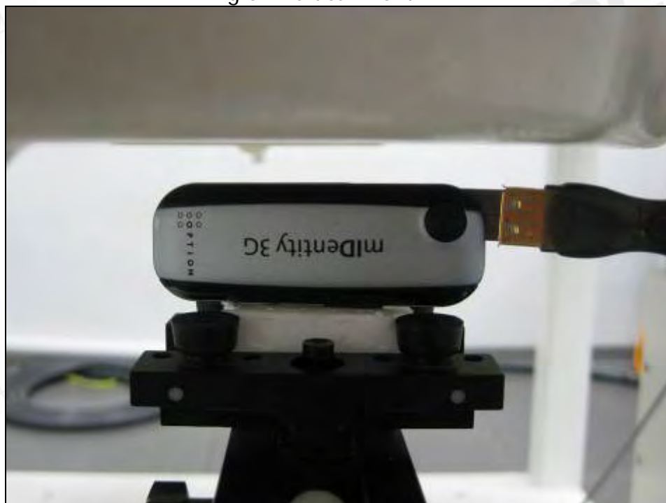
Fig 6 : Vertical-Back.

Unless otherwise stated the results shown in this test report refer only to the sample(s) tested and such sample(s) are retained for 90 days only. 除非另有說明，此報告結果僅對測試之樣品負責，同時此樣品僅保留 90 天。本報告未經本公司書面許可，不可部份複製。