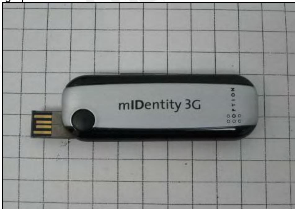
Fig.8 Front view of EUT