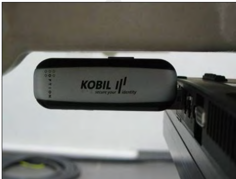
Fig 5 : Vertical-Front.