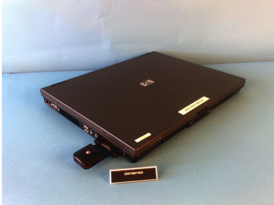
GE0421 and Adaptor Card in Laptop