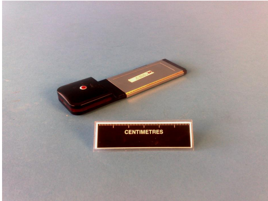
Equipment Under Test

The Equipment Under Test (EUT) was an Option NV GE0421 as shown in the photograph below. A full technical description can be found in the Manufacturers documentation.