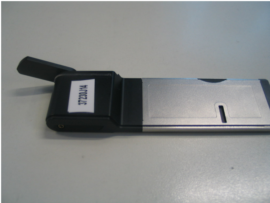
Photo 6: GSM/UMTS ExpressCard (auxiliary equipment, the photo shows an identical sample which was not used for the tests)