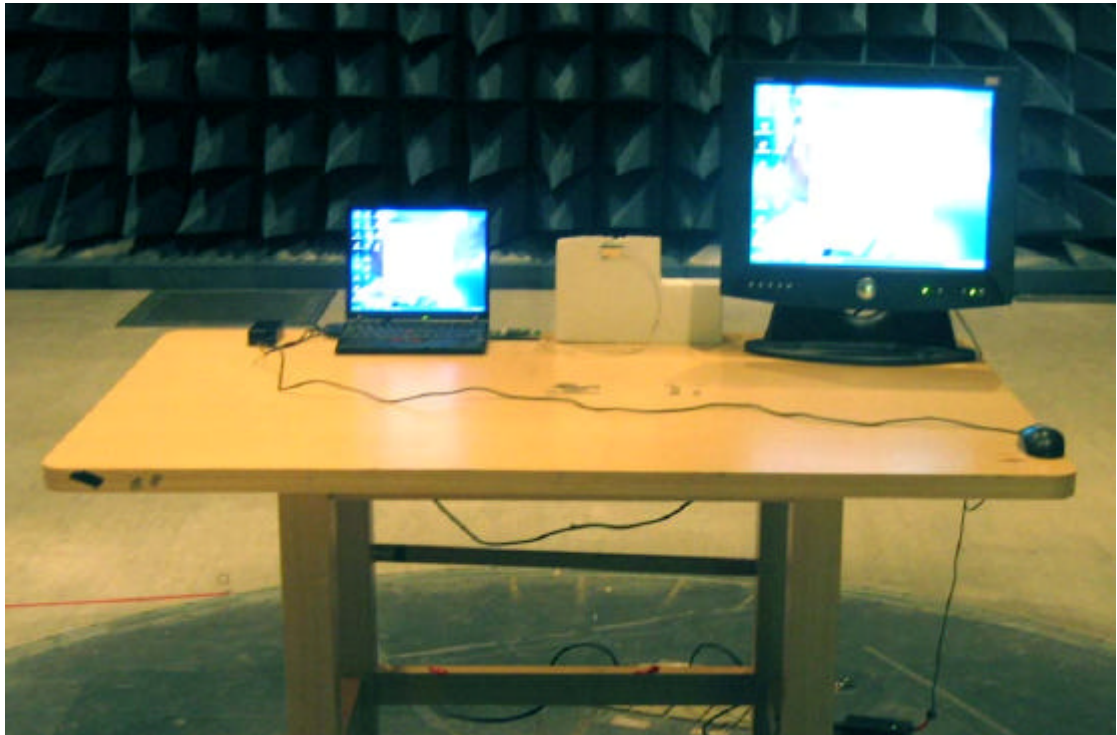
The Back View of Highest Radiated Set-up For EUT