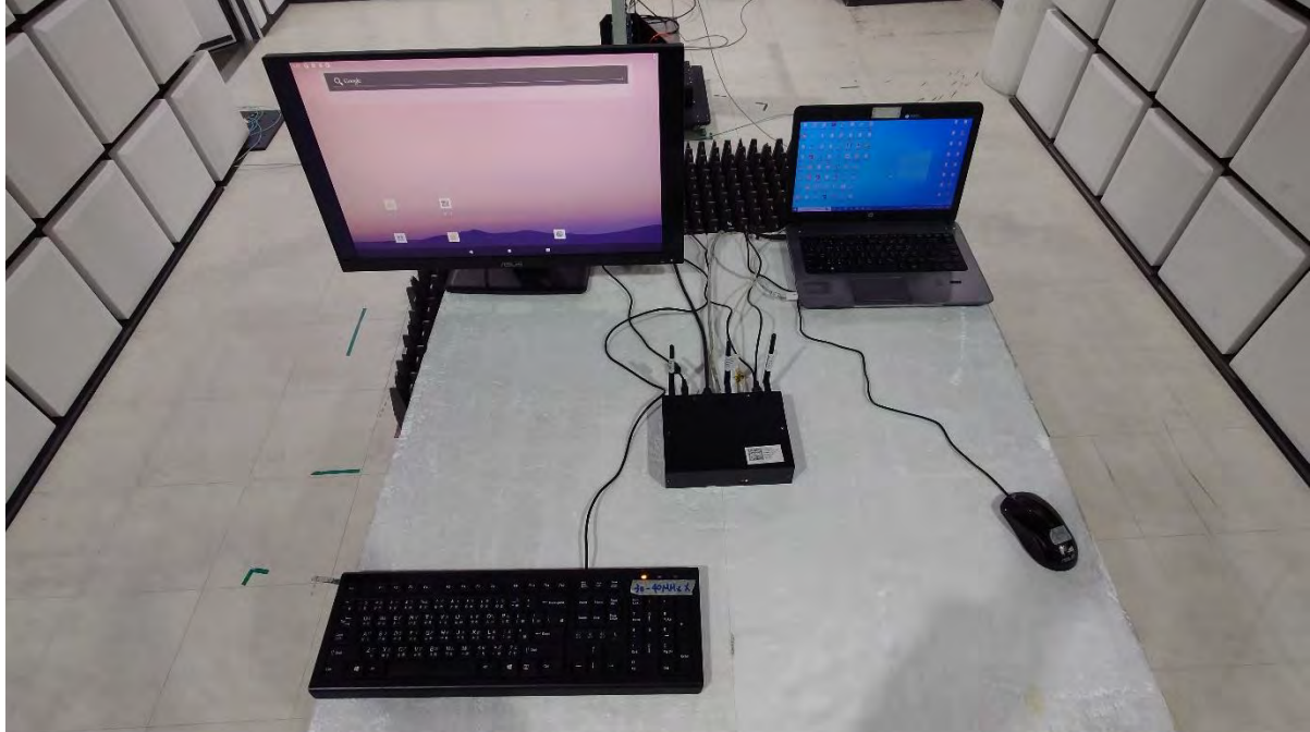
Above 1 GHz _ Rear View