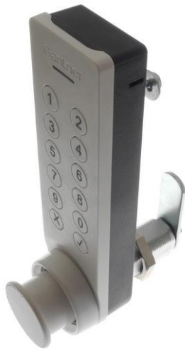
Figure 1: With PIN Code