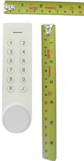
Figure 3: With PIN Code