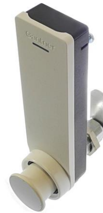
Figure 2: Without PIN Code