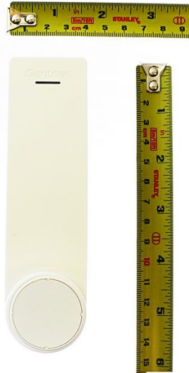
Figure 4: Without PIN Code