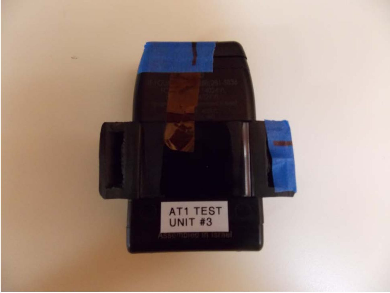
Back of Device