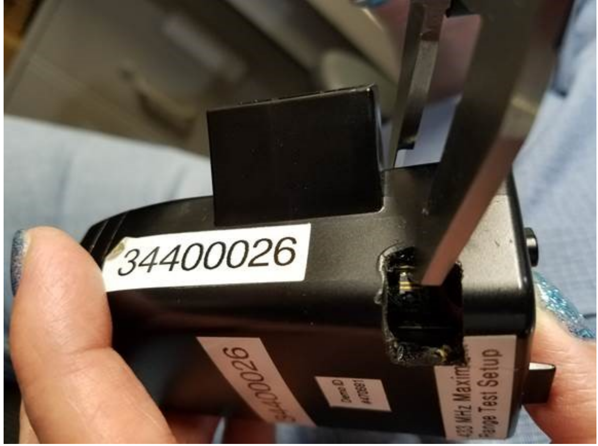
Calipers at the base of the Antenna