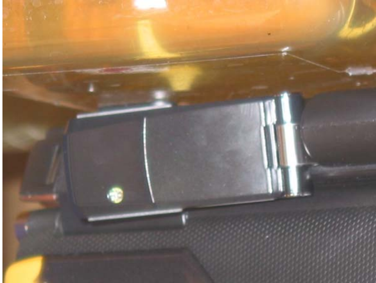
Left Configuration 5 mm