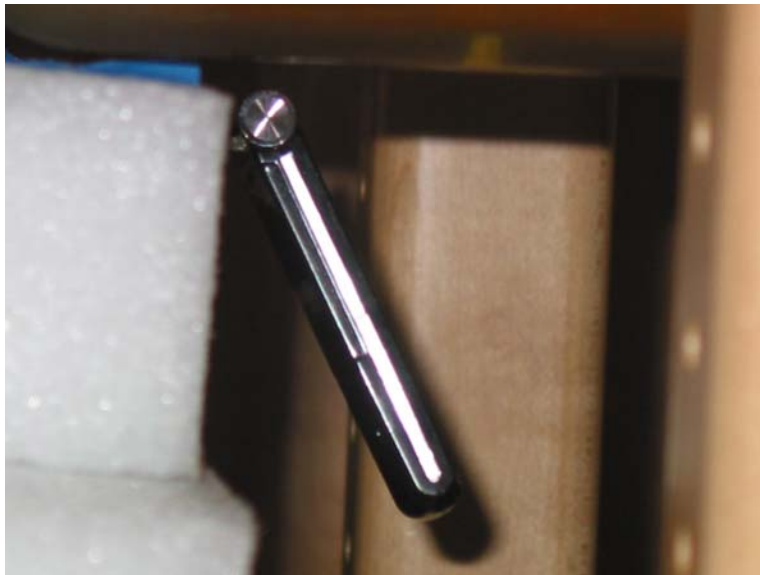
Bottom Front Configuration 5 mm