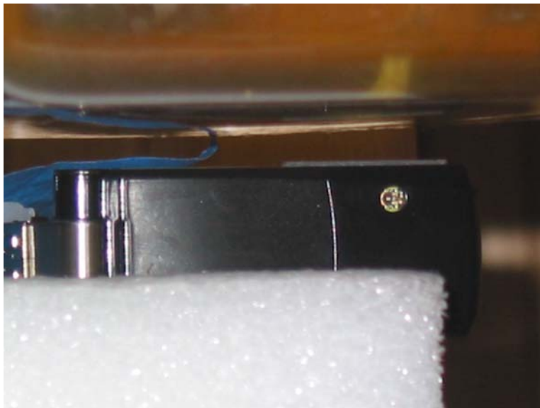
Right Configuration 5 mm