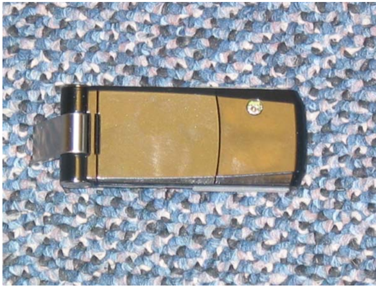
Back of Device