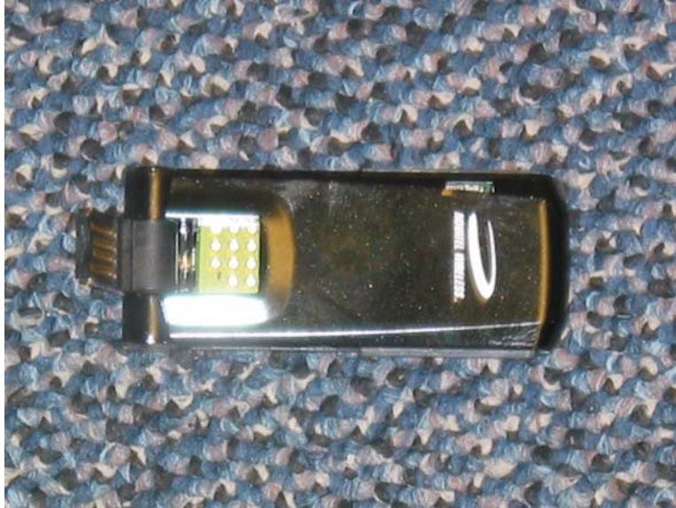
Front of Device