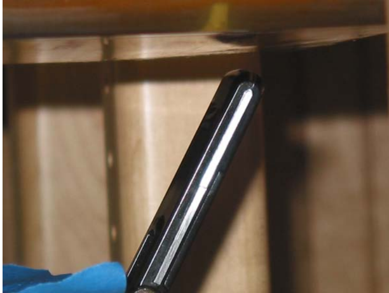
Top Front Configuration 5 mm