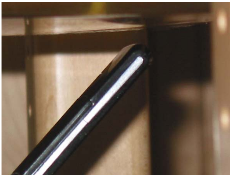
Top Back Configuration 5 mm