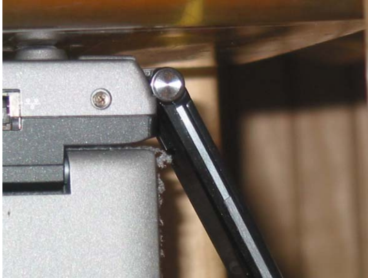
Bottom Back Configuration 5 mm