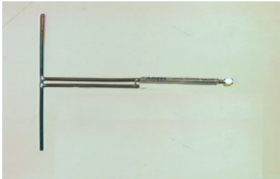
Reference Dipole Antenna Used for ERP Measurement